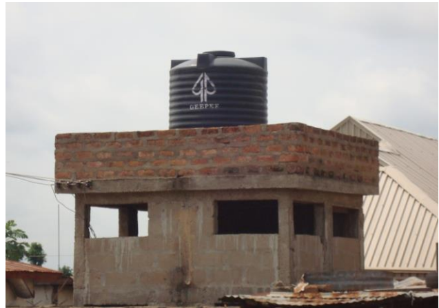
Plate 4: MBB adopted for the perimeter wall of a Water Tank Tower.

The MBB were said to be cheap, sold as low as #5/brick at normal period, while the highest price stands at #8/brick during the peak period as against the unit price of #100 and #120 for 150 mm and 225 mm sandcrete blocks respectively, implying masonry unit material cost of #235/m 2 to #376/m 2 using MBB as against #1000/m 2 to #1200/m 2 for sandcrete blocks. Hence a saving in masonry material cost of about 70% in wall. This is coupled with the fact that brickwall surfaces are often finished without additional