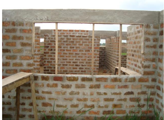
Plate 2: A modern structure being constructed using MBB.