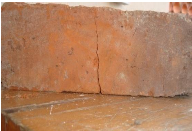
Plate 9: Crushed burnt brick (Sample A)