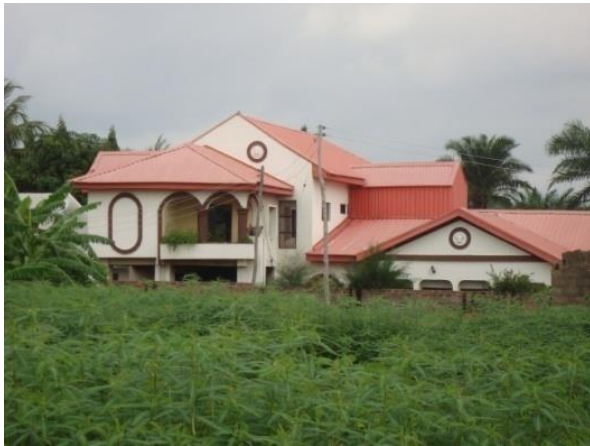
Plate 1: A modern structure built from MBB.

Makurdi Burnt Bricks can be said to fall specifically to the category of materials fitting into the scenario described by the researchers quoted above. The bricks were not only being adopted for modern building structures as shown in Plates 1 & 2, they are used for incinerators, drainage works, waterlogged sites and free standing walls of fence with little or no treatment as shown in Plates 3 & 4. The use of the MBB was noted not to be limited to private residential houses, public and corporate building structures were not left out. A good example is the wall of fence of J. S. Tarka Foundation Civic Centre in Makurdi.