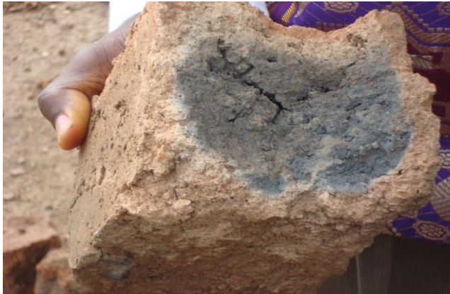
Plate 7: Inner ash colour of brick no well burnt