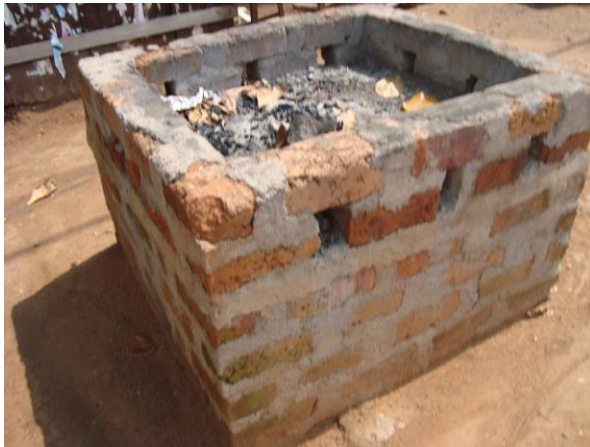
Plate 3: MBB used to construct an open Incinerator.