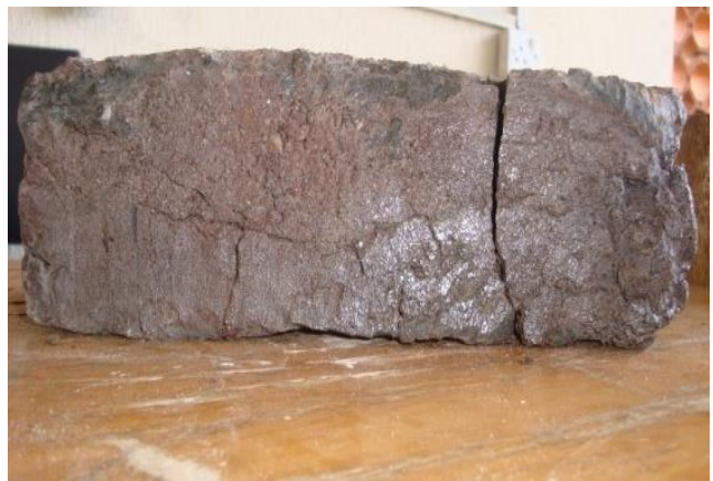
Plate 10: Crushed burnt brick (Sample B)

During the firing, the bricks shrink as much as 10%. As they were taken out of the staked batch after firing, they were sort to different grades with the main criteria being strength, irregular dimensions and sometimes cracks. Two classifications of good bricks always result from this process; well burnt bricks usually adopted for normal building construction (Sample A - those brick not in direct contact with fire source) and the over burnt referred to as iron-bricks - commonly used for drainages and waterlogged areas (Sample B - those brick in direct contact with fire source). Plates 9 and 10 presents Sample A having uniform yellowish brown colour and Sample B in dark grey/black shining charcoal-like colour.