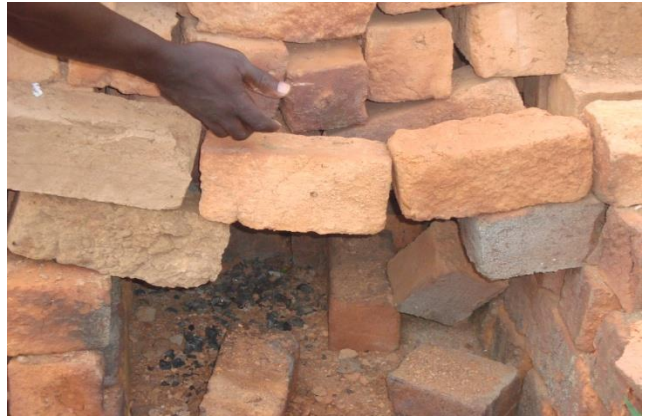
Plate 8: Stacked burnt bricks around firing channel