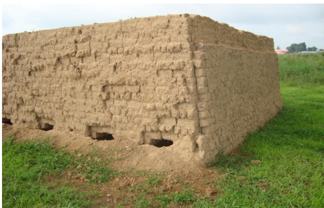
Plate 5: Staked bricks set for firing

When the bricks are well burnt, a cherry-red hue develops and this condition is held for about 6 hours. Sufficient fuel must be available when the burning starts as the entire batch of bricks might be lost if the fires were allowed to die down during the operation. Firing with wood took two to five days. The bricks were adjudged to have been thoroughly burnt when a part of the heap starts falling without the bricks breaking as seen in Plate 6. Burnt brick samples were examined by breaking off a part of the brick to see how the inner surface is; bricks not well burnt gave an inner colour of ash as in Plate 7 while well burnt brick gave a uniform yellowish brown colour same as the external surface.