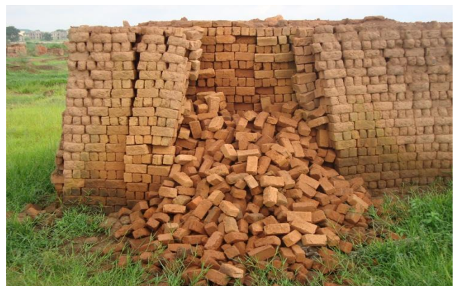
Plate 6: Staked bricks after firing