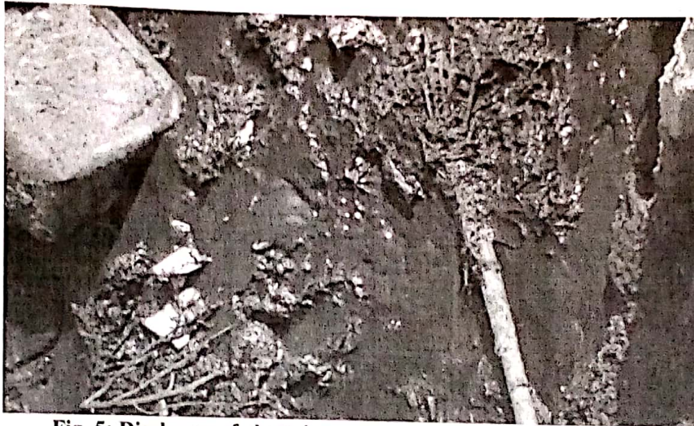
Fig. 5: Discharge of abattoir waste into open drains

The results of hydrochemical facies analysis show the water from hand dug wells in the studies area is Ca-Mg-Cl water type. This could have resulted from the mixing of highly saline water from surface sources such as domestic waste and septic tanks and ion exchange processes.