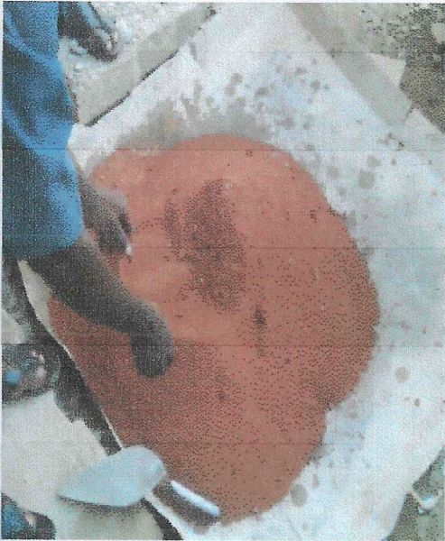
Plate 2: African termite mounds