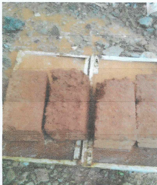
Plate 5: Manual Brick molding Machine