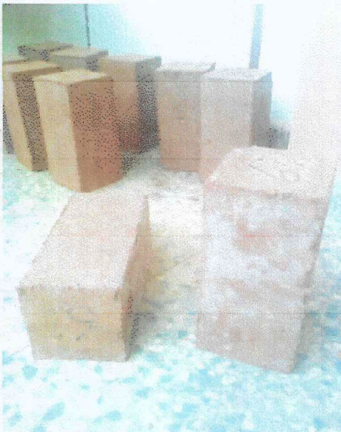
Plate 4: Termite mound soil