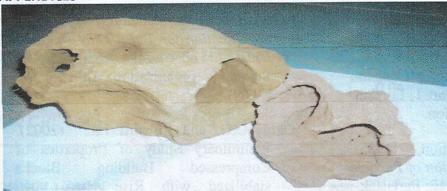
Plate 1: A termite mound sample