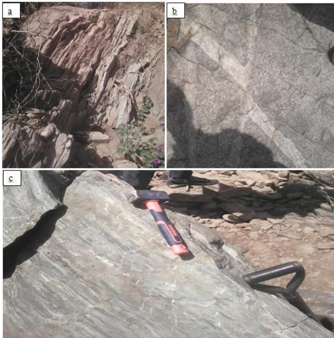
Plate 1: (a) A slightly weathered schist showing schistosity (b) Granite outcrop with fault (c) Weakly foliated amphibolite.

Saigbe and environs is mainly underlain by three Precambrian rocks. These include the schist, granite and amphibolite (Plate 1). The schist occurred as a low-lying outcrop and it is light coloured, medium to coarse-grained in texture and fairly weathered, and occupied 60% of the study area. Mineralogical compositions in hand specimen include quartz, feldspar and mica. The rock generally trend in NE - SW direction with a dip angle ranging between 25° - 35° E. There are presence of joints which are filled with quartz and quartzo-feldspathic veins. The granites, second in term of areal extent (32%) intruded the schist. Granite is prominent towards the north-western part of the area. They are leucocratic to melanocratic in colour, fine to coarse-grained in texture, consist of quartz, feldspar, muscovite and other dark minerals in trace amount. They are highly jointed and faulted, and this serves as an evidence of deformational processes in the area. The Amphibolite occurs mainly in the north-eastern part of the area, clearly along the main River Saigbe which is believed to have been structurally controlled. The amphibolite are medium to coarse-grained in texture, weakly foliated and dark in colour which may be due to the presence of hornblende and plagioclase minerals. It occupied the remaining 8% of the whole area studied. Summary of the soil samples and their characteristics as obtained from Saigbe area is presented in Table 1.