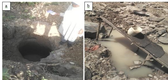
Plate 3: (a) An abandoned open pit (b) Contamination of water along the stream due to gold processing.