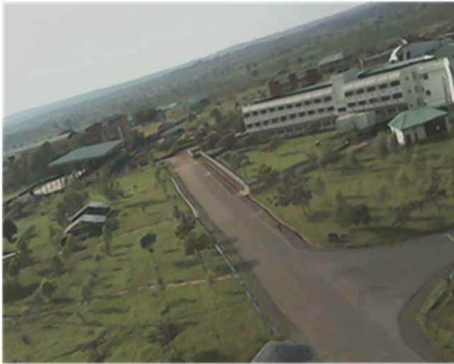
Plate 7 (a); FUT Minna, Senate Building Road