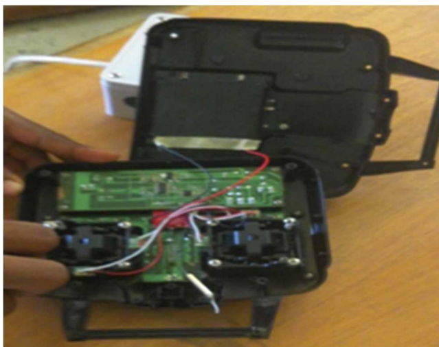
Plate 2: Pigtail antenna on the control board