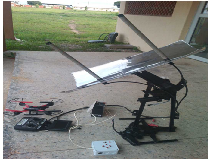
Plate 6: UAV extender system