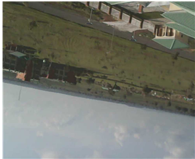
Plate 7 (d): FUT Minna, Back of Senate Building

The initial average communication range between the quadcopter and its control pad was measured after several field trails to be 108 meters. However, with the introduction of the Pigtail/Helical Antennas, the new average communication range was measured after several field trails to be 308 meters line of sight. It was observed that while a great distance was achieved, the battery capacity reduced from 5 minutes to 3 minutes due to the amount of power being consumed by the antennas.