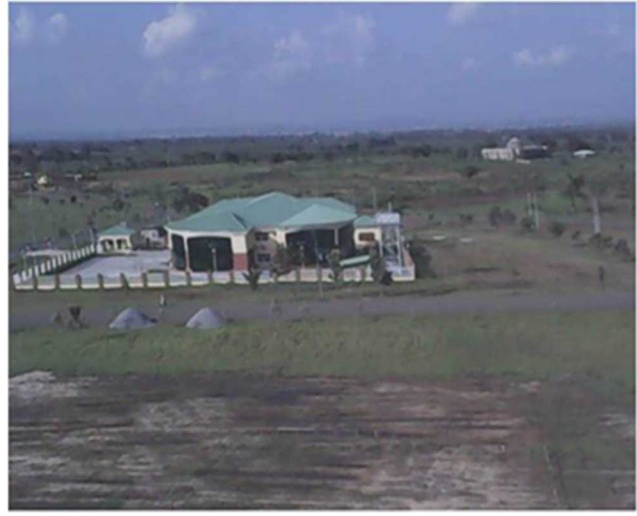
Plate 7 (c): FUT Minna, Academic Publishing Center