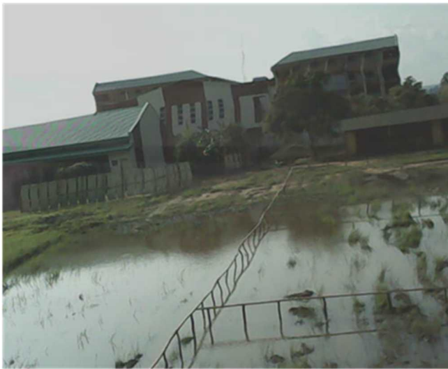
Plate 7 (b) FUT Minna, Research Farm