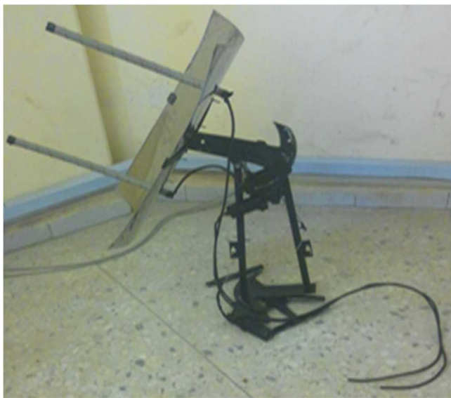
Plate 5: The helical antenna mounted on the Dual axis motorized stand