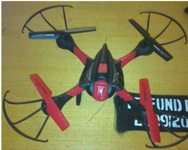
Plate 1: The assembled Quadcopter

In other to extend the communication range between the quadcopter and its control pad, the length of the antenna in both the control pad and LCD screen pad of the system were increased. We opened both the control board and the LCD screen and soldered 2cm of a 2.4 GHz Pigtail antenna to the length of the antennas found inside the two components. This antenna is described as pigtail because it has a high frequency coupling device called PIGTAIL, which enabled us to mount the antenna to the circuit. The end of the pigtail antenna in both the LCD screen and the control pad were connected to a female connector, the snapshot of this connection is shown in plate 2 and 3 respectively.