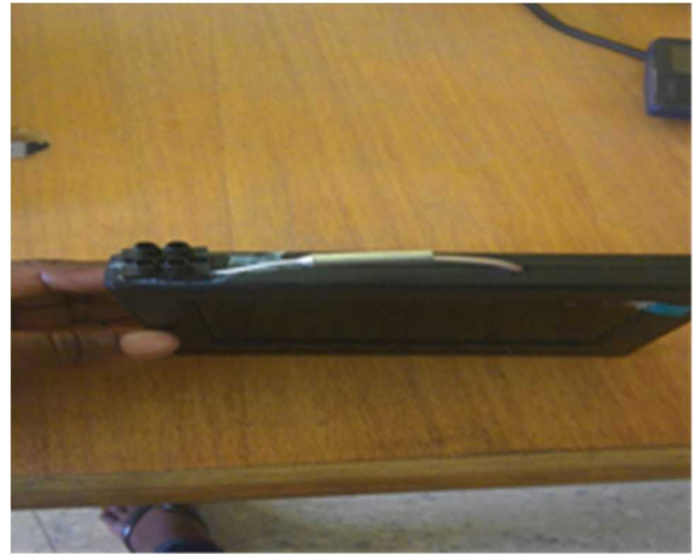
Plate 3: Pigtail antenna on LCD screen receiver.