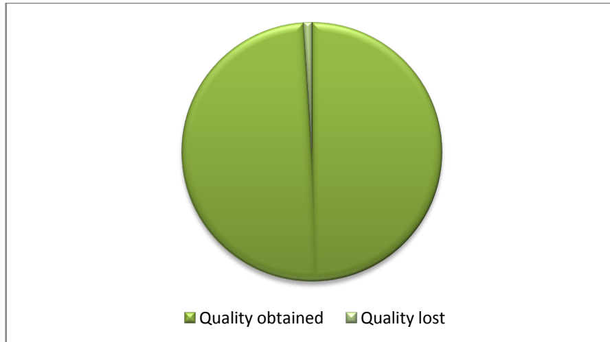
Figure 2. Percentage of quality obtained and quality lost for project 10