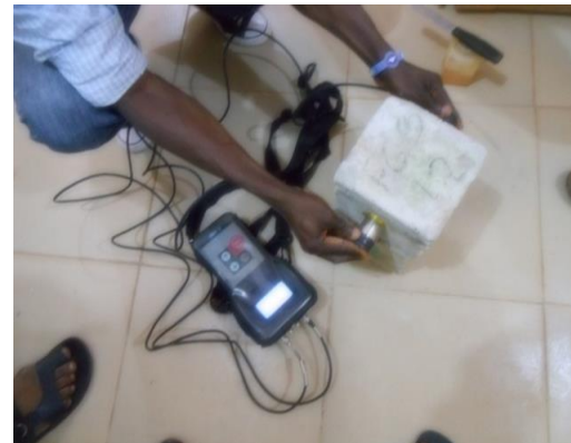
Figure 2 Testing using UPV machine