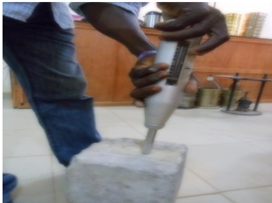
Figure 2 Testing using schmidt rebound hammer

The specimens were allowed to cool naturally to room temperature. Then, the Non-destructive test (NDT) and destructive test (DT) were conducted according to BS EN 12504 (2001), IS 13311 (1992) and BS 1881 (1990). Figures 1 and 2 show the NDT performed using Schmidt rebound hammer and UPV Machine, respectively.