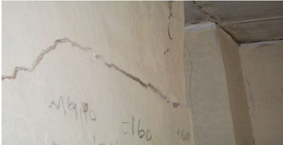
Fig. I. Hollow Block Wall Failure

This research investigate among block manufactures in Minna and metropolis area of Niger State the level of conformity to the quality assurance and standard specification, evaluate the production process employed in the production of hollow sandcrete blocks.. The water absorption properties and the compressive strength of various hollow sandcrete blocks with respect to their mode of manufacture were tested using compressive strength machine to crush the block samples in accordance to BS 2028. Secondly, the compressive strength of various sandcrete blocks was compared to NIS 87: 2004 and 2007, so as to assess the quality of sandcrete blocks produced in Minna and metropolis are of, Niger State, Nigeria.