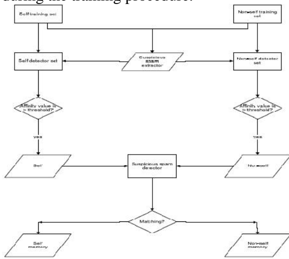
Fig.1 Improved E-Mail Classification Techniques

The figure below illustrates set of self and non-self detectors that are generated during the training procedure.