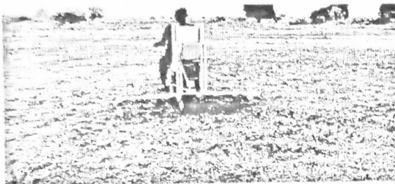
Plate 1: Spraying proces

The machine was tested as shown in plates 1 and 2 at four different ground speeds of 8, 10, 12 and 14 km/hr with a view of determining the spray application rate, field capacity, and field efficiency. Each of the experiment was done in triplicate and the results obtained are tabulated in table 1