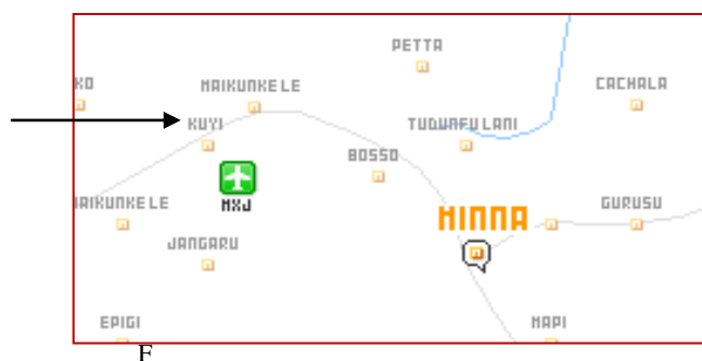
Fig. 1 Map showing Kuyi village in Minna

This research assessed a dump site soil as Kuyi village (Figure 1) in Minna, Niger state of Nigeria.