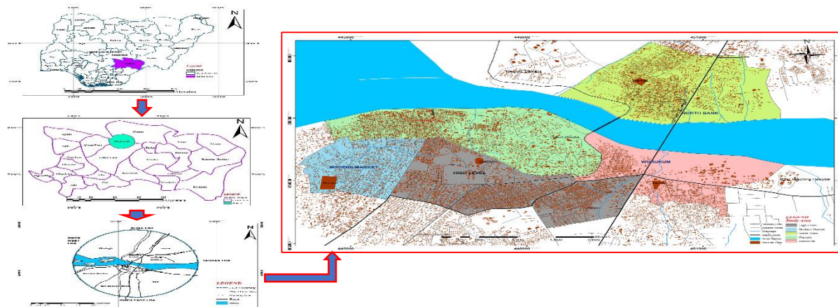
Figure 1: Location of Makurdi

small-scale animal husbandry, with others ranging from white collar-jobs to handcrafts and trading.