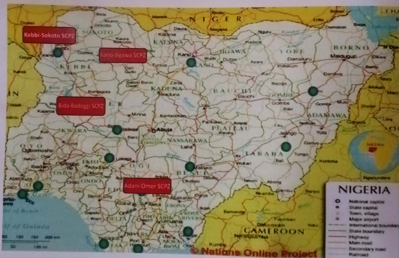
Figure 2: Map of Nigeria showing the Program Areas

ATASP-1 will be implemented in four Staple Crops Processing Zones (SCPZs) of Adani-Omor, Bida-Badeggi, Kano-Jigawa and Kebbi-Sokoto (Figure 2), which covers 33 Local Government Areas (LGAs) in seven States, namely: Enugu (Uzo Uwani, Udenu, Isi Uzo LGAs); Anambra (Ogbaru, Orumba North, Orumba South and Ayamelum LGAs); Niger (Agaie, Gbako, Lapai, Lavun, Katcha, Mokwa and Wushishi LGAs); Kebbi (Argungu, Bagudo, Birnin Kebbi, Dandi, Ngaski, Shanga and Suru LGAs); and Sokoto (Kware LGA); Kano (Bunkure, Kura, Rano, Dawakin Kudu, Garum Malam and Bebeji LGAs); Jigawa (Hadejia, Auyu, Kafin Hausa, Malamalodori and Gwaram LGAs). These States cover 194,426 km 2 of land and populated by 32,121,944 inhabitants (50.93% males and 49.07% females) who are predominantly farmers and small scale commodity processors.