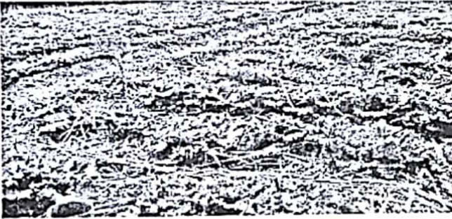
Plate A: Great Lake