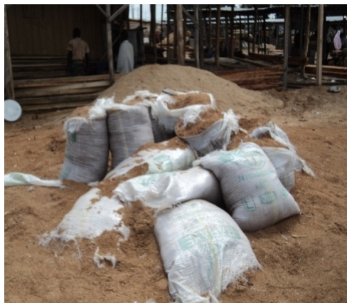
Plate 5: Bagged saw dust