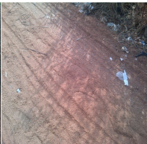
Plate 10: Dump site