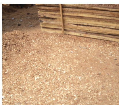
Plate 4: Face of a typical Timber shed