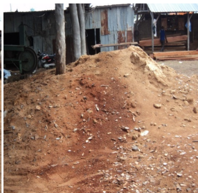
Plate 2: Indiscriminate saw mill waste dump