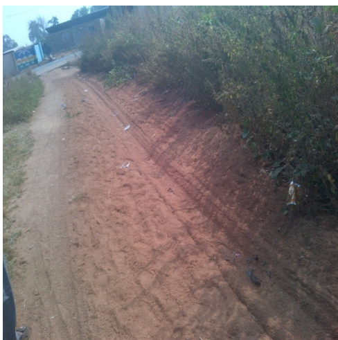
Plate 9: Road Fill