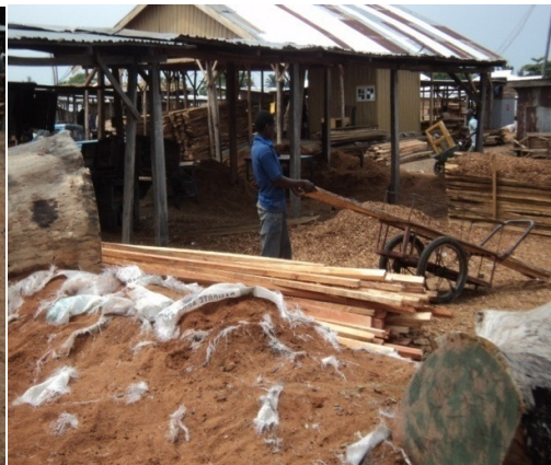
Plate 6: Heap of Bagged saw dust