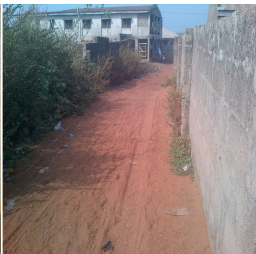
Plate 8: Filled Road Ditches