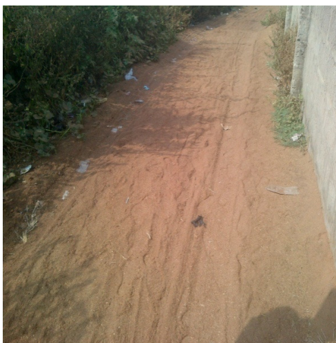
Plate 7: Road Fill