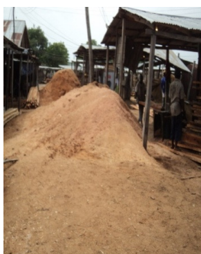
Plate 3: Face of a sawmill