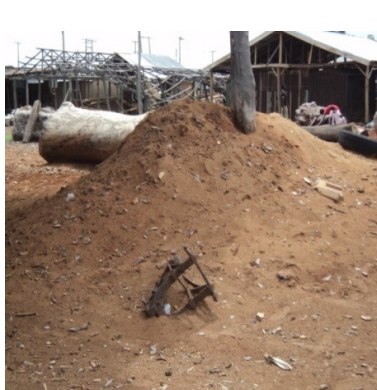
Plate 1: Heap of saw dust