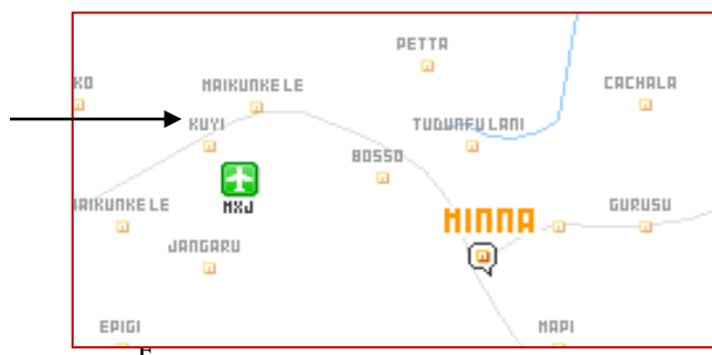
Figure 1 Map showing Kuyi village in Minna

This research assessed a dump site soil as Kuyi village (Figure 1) in Minna, Niger state of Nigeria.