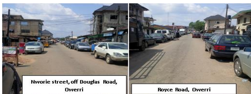
Figure 2 Street parking in Central Areas of Owerri Municipal

Several residents in the central part of the town do not have parking spaces for vehicles inside their compounds with most observed to be parking along the street as indicated in Figure 2. This affects the environment and health conditions of the area. However, the periphery areas have different situations due to the availability and provision of parking spaces in the residents' yards.