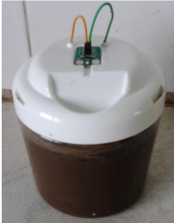
Plate 1: Soil MFC Complete Set-up