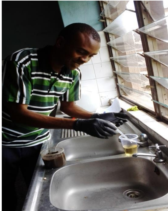
Plate 2: Urine Utilization in the soil MFC