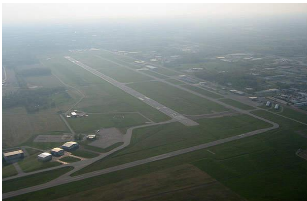
Plate 1: Satellite View of Nnamdi Azikiwe International Airport.