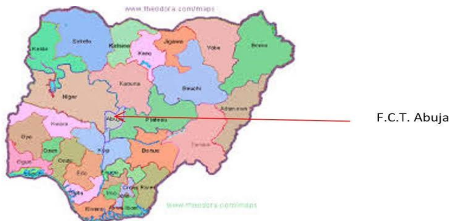
Figure 3 Map of Nigeria showing Abuja

Arik Airlines is a Nigerian airline with two bases: Murtala Muhammed International Airport in Lagos and Nnamdi Azikiwe International Airport in Abuja. Arik Airlines flies to a number of regional and mid-distance locations throughout Africa. Three years after Nigeria Airways' death, on April 3, 2006, Arik airline took over the former airline's Lagos facilities and began rehabilitation work. On June 14, 2006, Arik Airlines received two new Bombardier CRJ-900 aircraft for use on small flights in Nigeria. Arik Airlines began scheduled passenger service on October 30, 2006, with four CRJ 900 aircraft flying between Lagos and Abuja. Calabar flights began on November 15, 2006, while Benin City and Enugu services resumed on January 7, 2007. The airline is solely owned by Ojemai Investments.