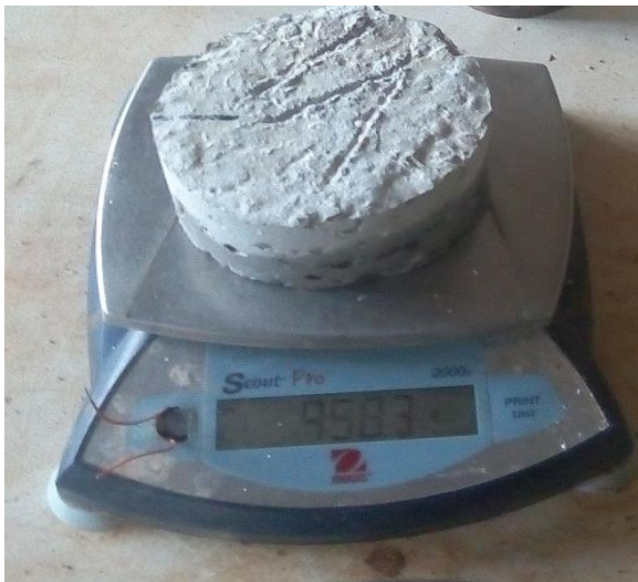
Plate 2: Setup for weighing Balance