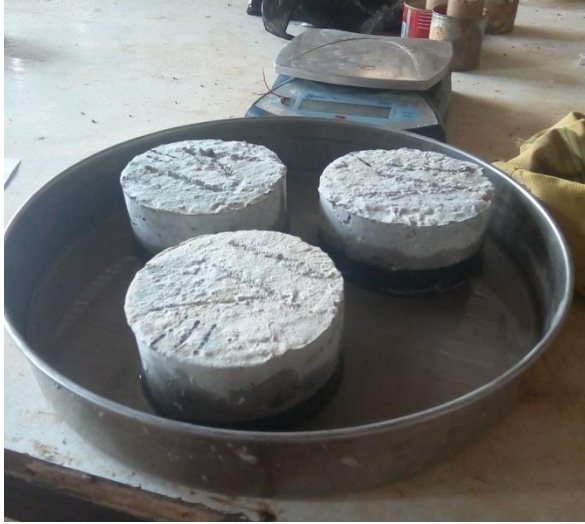
Plate 1: Setup for Sorptivity Test