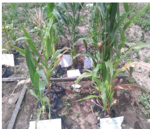
(b) Dent maize