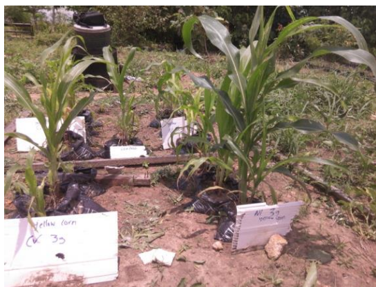
(a) Sweet maize

Three seeds of each of the sweet and dent varieties of maize were sown at a depth of 5 cm in polythene bags containing 3 kg of the soil. The experimental design used was 2^2 by 2 general factorial design consisting of 4 treatments (1 g/dm 3 of Ni ( \text{NO}_3)_2 \cdot 6\text{H}_2\text{O} ; 3 g/dm 3 of Ni ( \text{NO}_3)_2 \cdot 6\text{H}_2\text{O} ; 1 g/dm 3 of Cr ( \text{NO}_3)_2 \cdot 9\text{H}_2\text{O} and 3 g/dm 3 of Cr ( \text{NO}_3)_2 \cdot 9\text{H}_2\text{O} ), 2 replicates of each and the control. The setup was made for each of the maize types. Of the polythene bags, three bags were contaminated with 1 g/dm 3 concentration of nickel and another three with 3.5 g/dm 3 . The same levels of concentration (1 g/dm 3 and 3 g/dm 3 ) were made for chromium and another three polythene bags without nickel and chromium were also used for the control (Plate 1). The setup was made for each of the maize types and the crops were irrigated every 2-3 days for seventy days. Analysis of the control and contaminated soil samples were done before planting the seeds. Subsequent to the planting of the seed, samples were also taken and analyzed to determine the amount of heavy metal in the soils at two weeks intervals for duration of ten weeks. At the expiration of the 70 th day, the plants were uprooted after the soil samples had been taken, and the root, stem and leaves were also assessed for the heavy metal content.