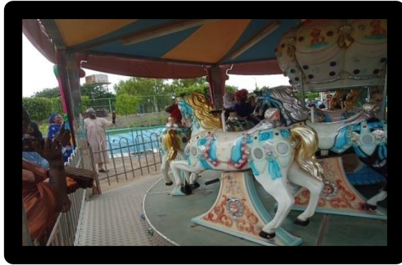
A: children amusement area