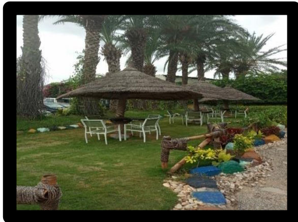
D: passive Sit-out