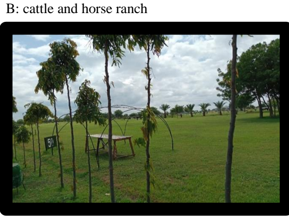
B: cattle and horse ranch