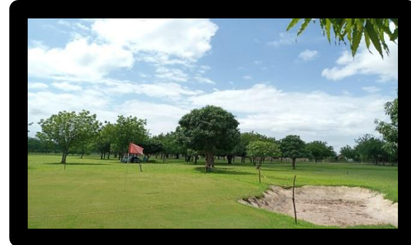
E: golf course