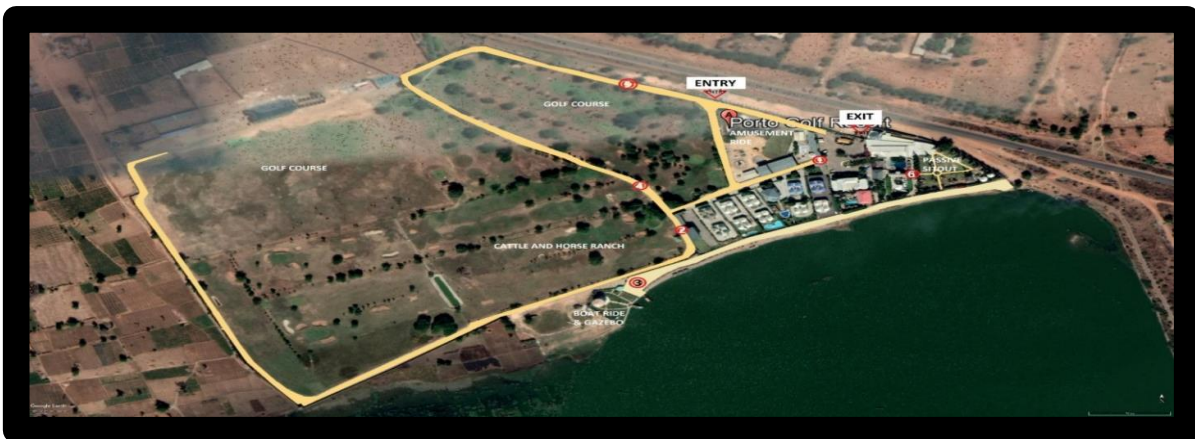
Figure1: Aerial view of Minjibir Park Kano