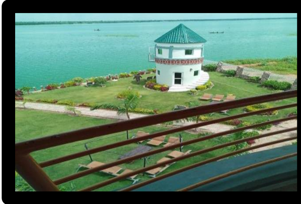
C: boat ride and gazebo