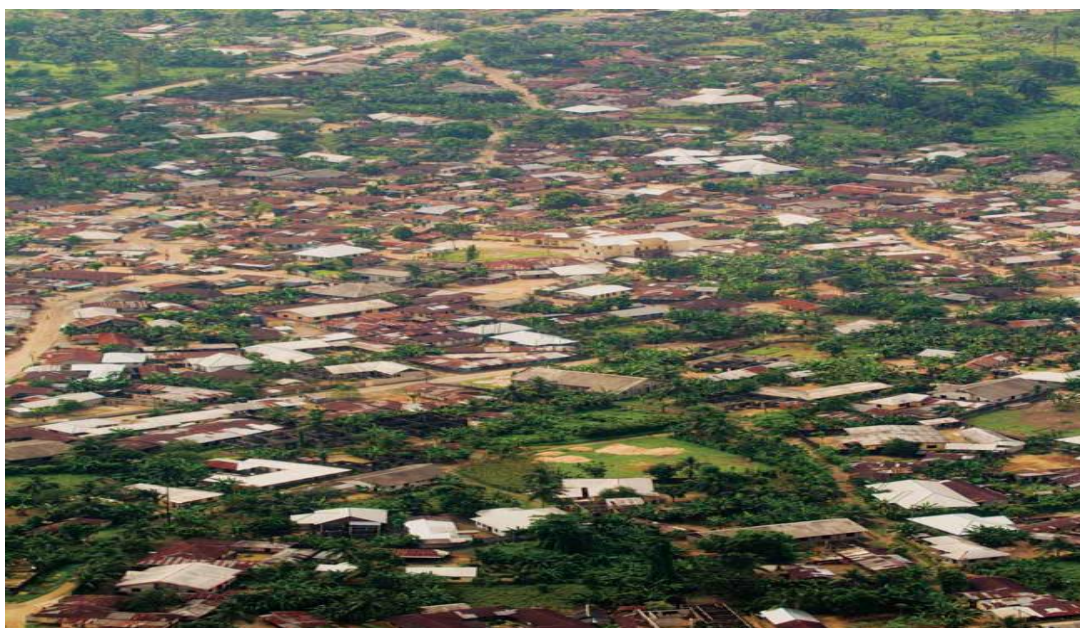
Figure 2: Roofs of houses in brown colouration as a result of Acid rain.

Gas flaring discharges hazardous particles into the atmosphere as it is a common practice within the entire Niger Delta (Buzcu-Guven and Harriss, 2012; Emam, 2016). This practice releases partially burnt or unburnt hydrocarbon substances into the atmosphere, causing serious air pollution with ensuing severe environmental and public health implications (Emam, 2016). Partially burnt hydrocarbons in the atmosphere mix up with rain, reducing pH of the water to 4.98-5.15 range thereby causing acid effect (Nwankwo and Ogagarue, 2011). Roofs of houses in Ogoniland are conspicuously seen in brown colouration as a result of corrosion caused by acid rain (Efe, 2010; Ejelonu et al. , 2011). This makes roofs of houses to get old quickly as perforated and leaking house roofs are common occurrence within the Ogoni communities (Okhumode, 2017).