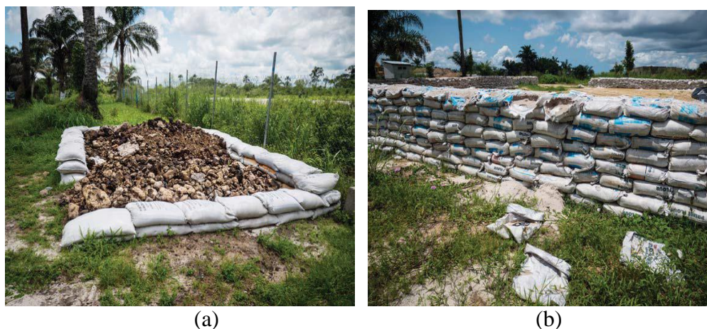
Figure 6: (a) Badly constructed and abandoned Biopile. (b) Incomplete Biopile construction with sandbags used as side walls seen already ripped off, compromising the strength of the biocell wall.

Poor planning and lack of commitment on the part of the Federal government and of course the oil company culminated in operational faults and failure. The Covid 19 pandemic lockdown of 2020 was on hand to provide an immediate excuse for workers on the site to completely abandon the remediation program. Hence, it has become very difficult to ascertain the effectiveness or otherwise of the afore mentioned remediation protocols being applied in the clean-up of crude oil polluted Ogoni environments (Amnesty International et al. , 2020). For instance, the biocell and biopile systems which depend wholly on microbial actions on the pollutants operate on chance. The contractors do not know any of the microbial species involved in the hydrocarbon degradation, there was no