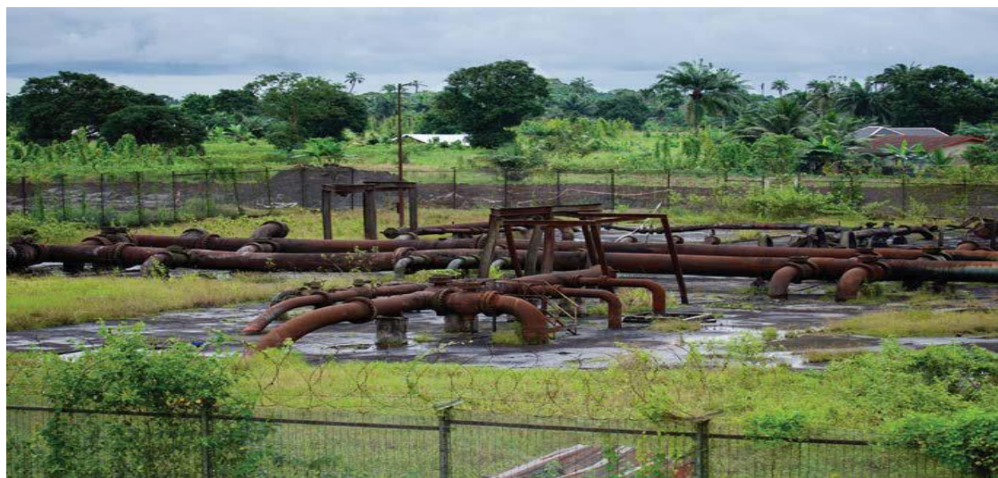
Figure 1: Abandoned Flow station at K/Dere, in Gokana LGA.

Many years after cessation of crude oil exploration by the SPDC in some fields, there are still traces of crude oil pollution in Ogoni environments, particularly the aquatic environments (UNEP, 2011). Network of oil transport pipelines convey about 150,000 barrels of crude oil daily through Ogoni Shell's export terminal at Bonny Island (Kelechukwu and Ruth, 2020). These pipelines leak as a result of corrosion or act of sabotage, abandoned dilapidated flow stations and other illegal oil-related activities ensured continuous pollution of the environment (Figure 1).