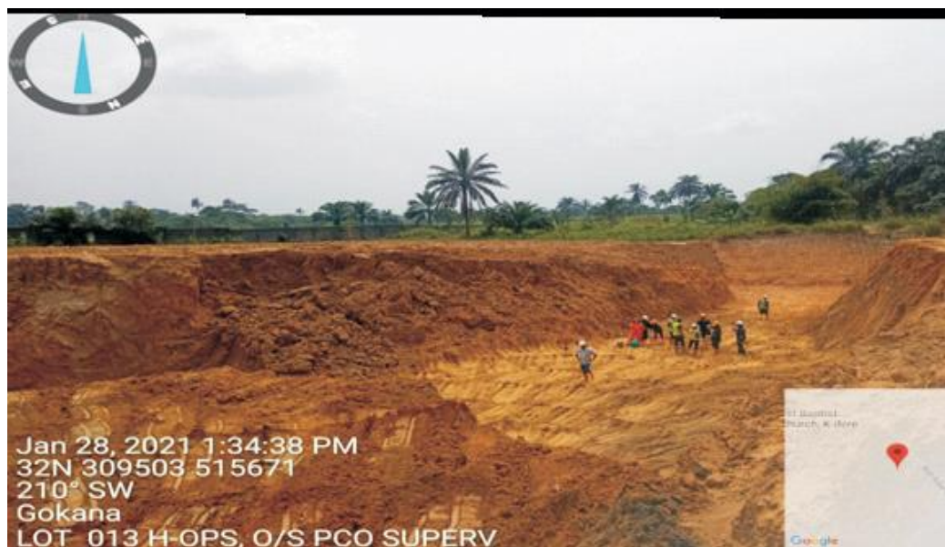
Figure 8: Excavated soil taken to treatment site.

The choice of excavation and evacuation to an offsite location; a quick remediation strategy, was adopted probably to minimize the risk of continuous movement of the contaminant into the subsoil if treatment is to be done in situ (Rosalie et al. , 2020) or to hasten the clean-up exercise following the aggravation of the environmental situation as the sites were abandoned during the Covid 19 lockdown.