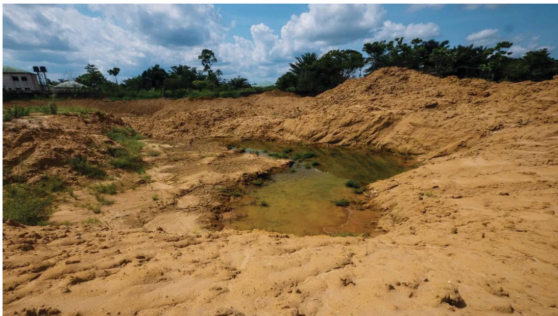
Figure 4: Indiscriminately disposed contaminant.