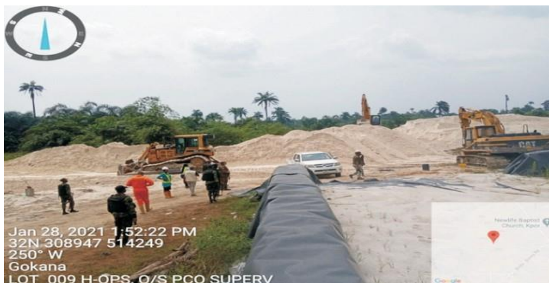
Figure 9: Treated soil ready for evacuation by the local sand dredger.