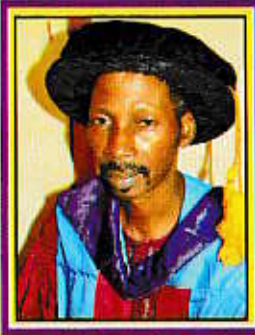
Prof. M. G. M. Kolo Postgraduate School