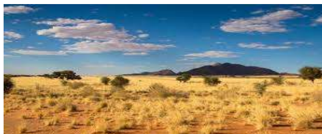
Use the diagram to answer question 14