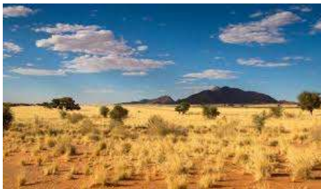
Use the diagram to answer question 14 and 15