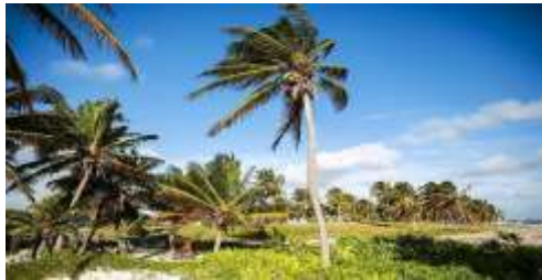
Use the diagram to answer question 18 and 19.