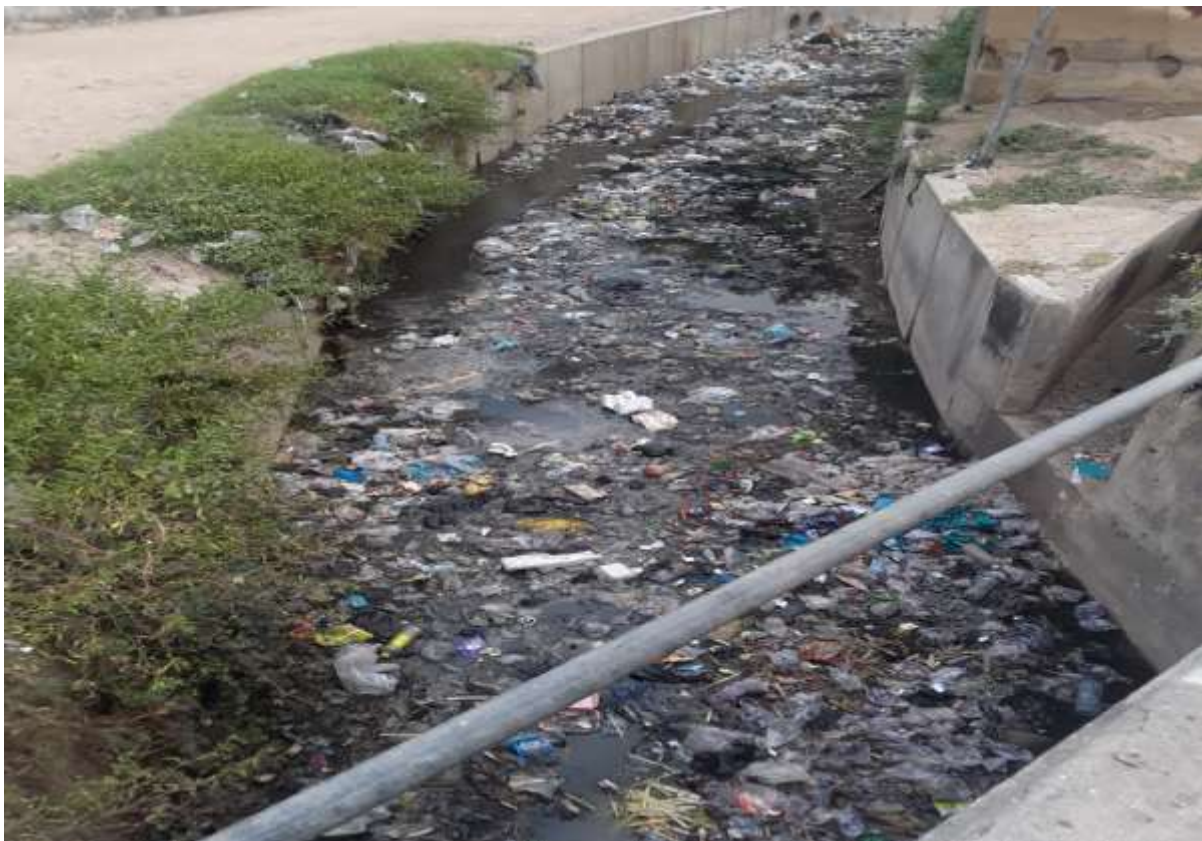
Plate II: General hospital Minna.

This is the method by which residents dig or construct small outlets at ground level which were used to discharge waste water into storm water drainages constructed by the State Government. In some houses very close to the storm drainages the sewage flow in directly while in other areas some meters away the sewage has to travel to reach the drainages. Some of these drainages are found along major roads and others are found within residential areas. However inside all these drainages the sewage does not flow freely as waste materials of different kinds and sizes fall into the drainages choking and blocking sewage flow.