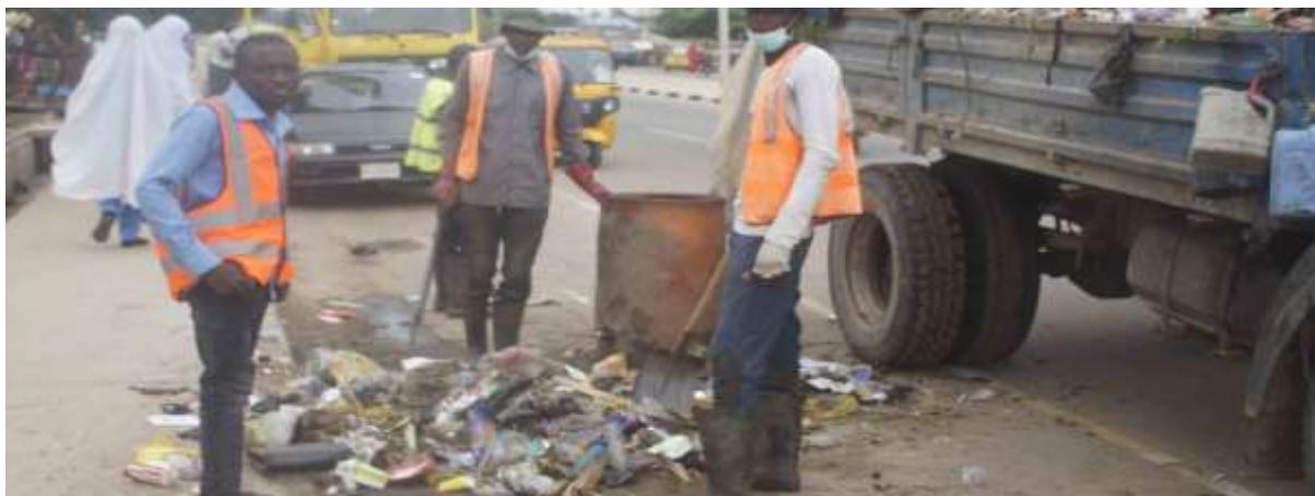
Plate I: Roadside dumping site Bosso Minna, Niger state

Although majority of large cities have administered sewage management practices at different levels of sophistication, in some African countries there is no official solid waste management policy. For example, in many Nigerian towns and cities, including Minna, there is no door to door sewage collection programme. Roadsides, ditches, drainages, water bodies, empty plots of land, farms, wetlands, uncompleted buildings are sites observed for dumping of household sewage in most Nigerian cities.