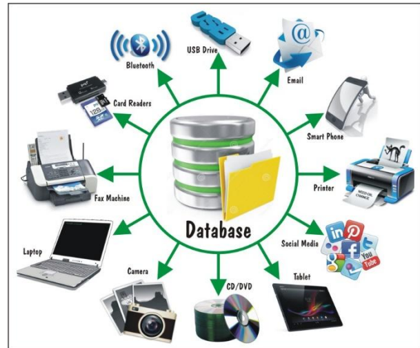
Figure 3. Some common data leaking channels

Some of them will require a great number of techniques and monitoring to adequately secure them.