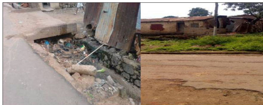
Figure 4: A bare ground covered with roofing sheets used as a bathroom with waste water channelled into the open drains in Kabawa community