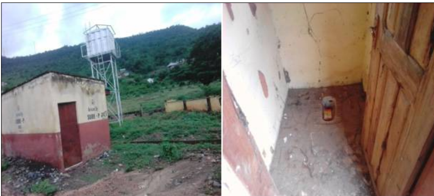
Figure 2: Non-functional 4-pour flush toilet facility in Kabawa community

Interviews were conducted to complement the descriptive variables captured in the study. Three of the interviewees were residents (youth leader, and two community elders) in the sample community, while one interviewee was a public officer