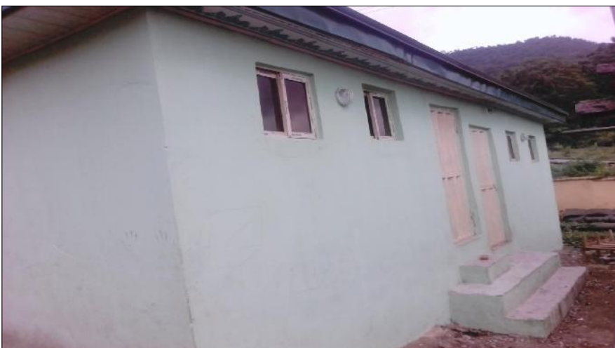
Figure 3: A yet-to-be-commissioned Federal Government-provided 6-water closet toilet facility in Kabawa