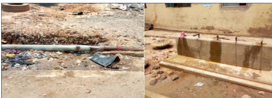
Figure 8: Poor conditions of the water-supply facilities by the Kogi State Water Board