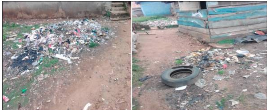
Figure 5: Poor solid waste disposal in Kabawa community

The researchers directly observed that the government water-supply facilities in the area are in a state of disrepair. Residents report the poor perception of potable water provision, although the poor facility provision does not depict the government's 'complete' neglect of the community. Direct observation and interviews revealed government's physical development interventions through motorised solar-powered pipe-borne water-facility provision through the Sustainable Development Goals (SDGs) Project in 2016 (Figure 7A).