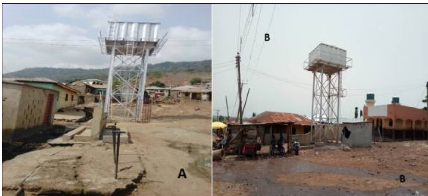
Figure 7A/B: Water supply facilities provided under the Sustainable Development Goals (2016); Figure 7A by the Federal Government of Nigeria (2017); Figure 7B by the community

Popoola and Magidimisha (2020) recognise the role of community in ensuring improved liveability and enhancing livelihood options. Concerning the respondents' preference and willingness to support liveability-enhancement projects, captured open response reveals that the majority of them opted for the electricity project as their major priority for the area. Others include willing to support social housing project, construction of roads, sanitation facilities, drainages, markets, and new schools, youth empowerment programmes, sound security infrastructure, and the support agricultural development projects. The findings indicate that the interests of the residents differed. They were all willing to