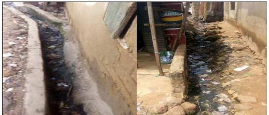
Figure 6: Unsanitary conditions of open drains in Kabawa community