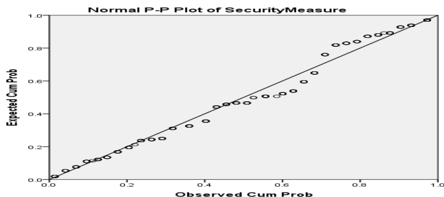
Fig. 1. Normal P-P plot for security measures

building characteristics were in normal condition to determine the building security cost. In addition, the normality of the determinants factors were further proven by normal P-P plot with all the points closer to the reference line signifies that the results were normal. However, this supported the skewness and kurtosis results. Therefore, these findings stirred this study to evaluate the magnitude of effect of the established building security cost determinants factors as the following analysis pursued.