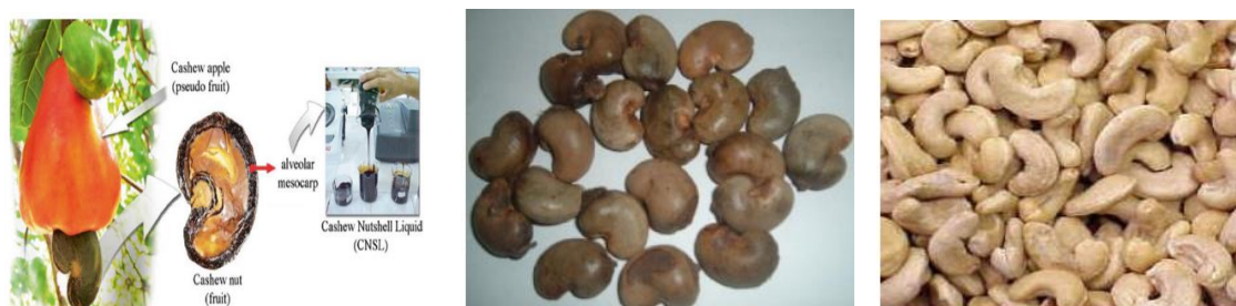
Figure 1. Cashew pedicel, fruit, and mesocarp filled with CNSL, cashew nut and cashew kernel (Source: Lomonaco et al. , 2017 and Bart-Plange et al. , 2012).

The physical and mechanical properties of cashew nut shells and kernels have unique characteristics which set them apart from other engineering materials to be used as reinforcement material for the production of agro-based brake pad was used for this research. Okele et al. , (2016), Bart-Plange et al. , (2012), and Teye and Abano, (2012) have extensively determined these physical and mechanical properties by these researchers with favorable results to exploited.