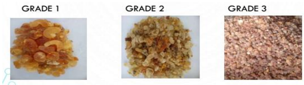
Figure 4: Different grades of gum arabic (Source: Tunde, 2018).