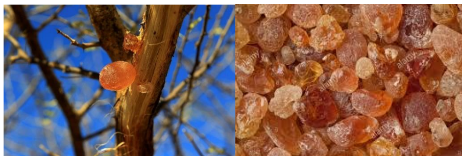
Figure 2. Gum Arabic as seen on an Acacia tree

The plant gum known as Gum Arabic was obtained from the dried exudates obtained from stems and branches of Acacia Senegal wild plant belonging to Acacia species and the Fabaceae family (Tunde, 2018). It is a semi solidified sticky fluid oozing from incision made on bark or branch of acacia trees as shown in Figure 2.