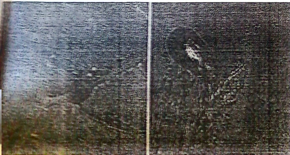
Figure 3: Podagrica unifirma (brown flea beetle) and Nisotra dilecta (blue flea beetle)