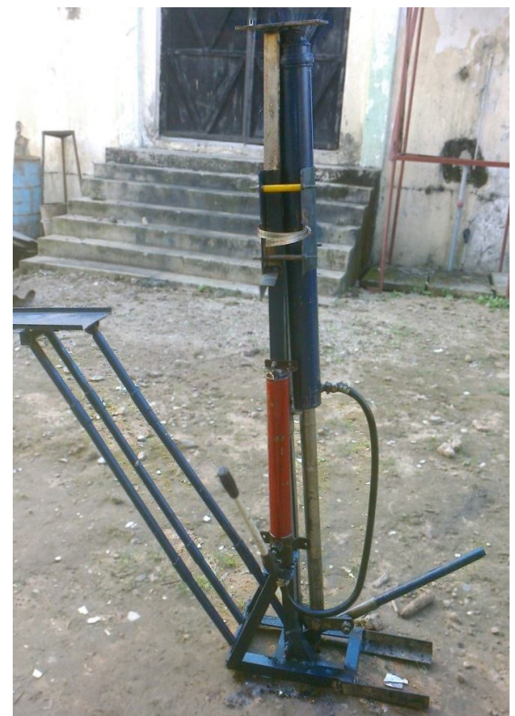
Figure 1. Assembled Hydraulic accumulator lift machine

After the lift linkages were attached to the lower end of the frame, the load platform was attached to the forward linkages with hinges that allowed it to maintain a permanent horizontal position at every position of the linkages in the lifting of loads. The hydraulic accumulator was mounted in a vertical position on the stand frame with aid of a lower supports and anchor plates. The positioning for the hydraulic accumulator was such that the ram shaft moved out downward from the cylinder. This is such that the hydraulic accumulator does work by forcing the ram shaft out downward thereby pushing down on the rear linkage which therefore lifts the forward linkages. The hydraulic accumulator was connected to a pump by a high pressure connecting pipe. The rubber flexible pipe linked the inlet/outlet opening on the hydraulic accumulator to the pump. The pump supplied the pressured fluid to fill the lower part of the hydraulic accumulator. The pump has a reservoir that stores up the hydraulic fluid when the machine does work in forcing out the fluid. The pipes were fastened to the pump and hydraulic accumulator using clips. Then the entire machine was painted blue for ergonomic and to protect it from corrosion as shown in Figure 1.