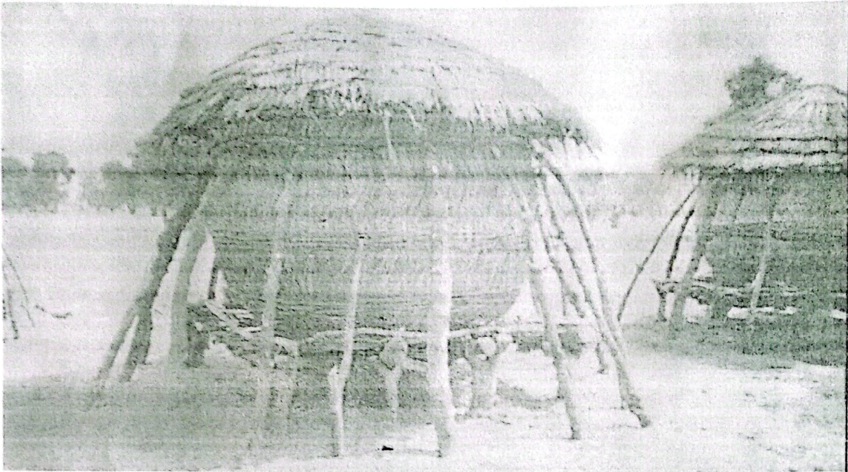
Plate 4: Thatched Rhombus with tree stem columns, showing tree stem external support

The question is how do you justify using investment method of valuation for this house and other improvements on the farm land? Where is the comparables? Where is the rent? Even, undeveloped land here, how do you use market value here? Where is the data? Where is the market survey?