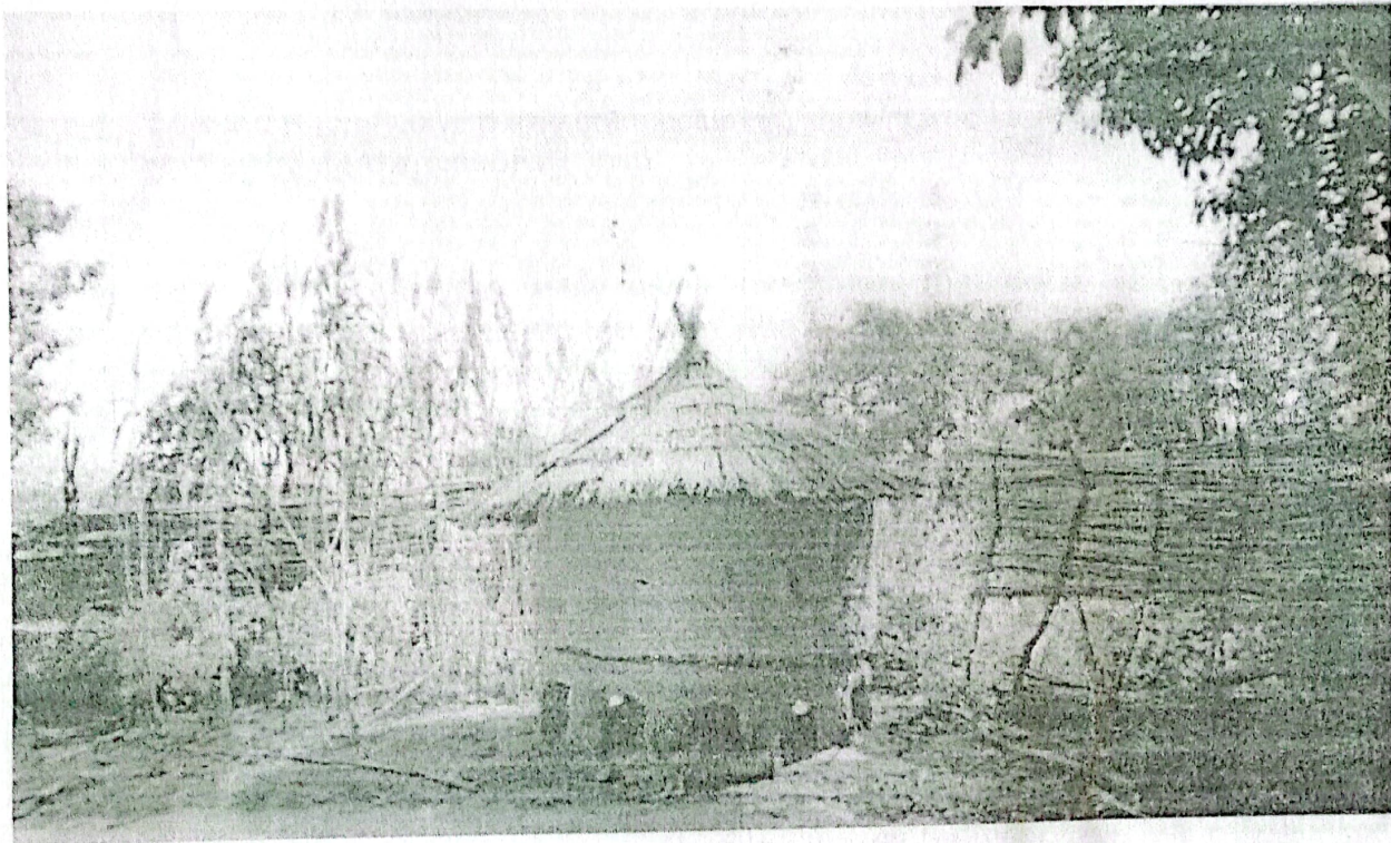
Plate 3: Mud Rhombus with stone grillage foundation floor assembly and thatched roof 15