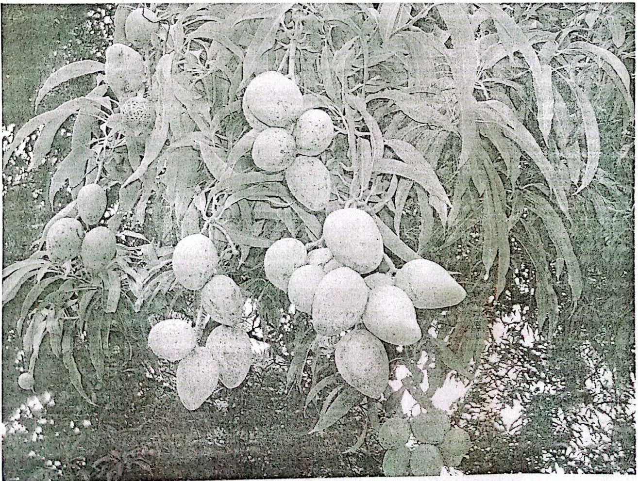
Plate 6: Mango Tree

The price of these economic trees should not be fixed arbitrarily because this is an investment compulsorily acquired by government and it should be treated as such.