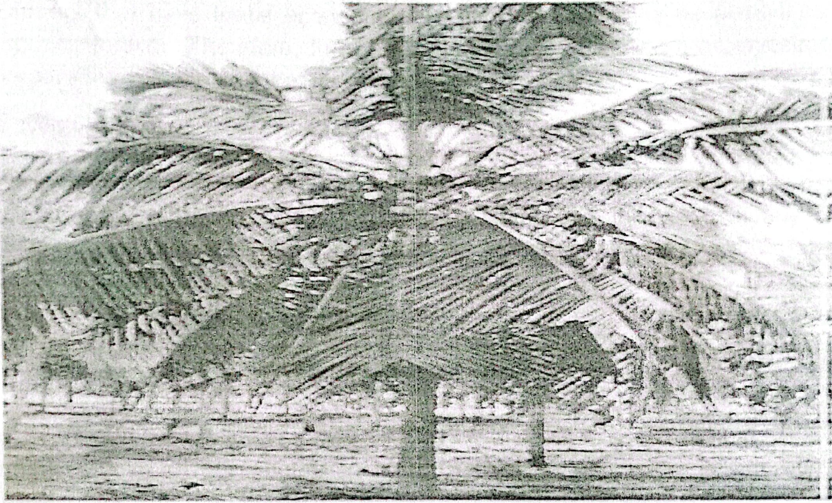
Plate 5: Coconut tree