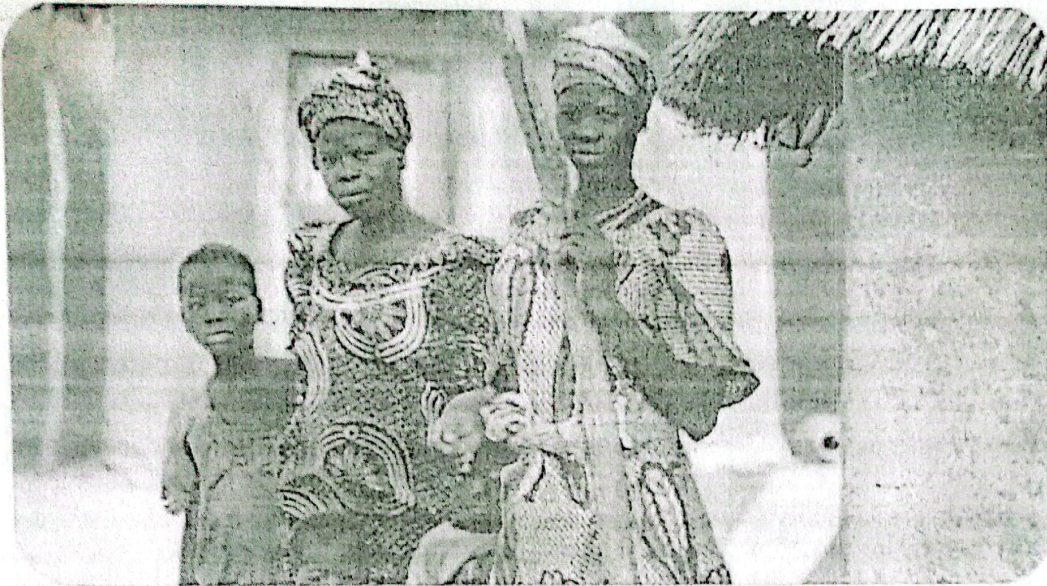
Plate 2; mud house