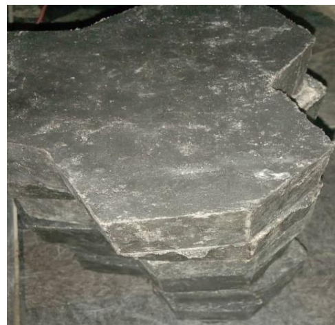
Final polymer modified concrete