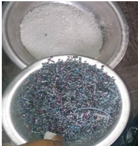
Polymer Pellets and Sandstone

The mould was fabricated in-house. The shape of the mould was that of an interlock pavement block. The uniform mixture of molten wax and sandstone was poured into the mould and allowed to take the shape of the mould. The essence of moulding is to give shape and size to the pavement block. The moulded polymer concrete composite was then immersed in water for about a minute in other for it to cool, and likewise solidify. Among the significant properties of LDPE is its capability to cool at a quick rate. The cooling process also helps to strengthen the molten wax mixture consequently providing it with the preferred shape and size. The cooling stage is the last step in producing the polymer-modified pavement block. The stages are captured in Figure 1.