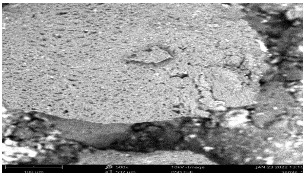
Figure 1: SEM of POFA at the magnification of 500X (537µm and 10KV).

Figure 1 depicts the SEM image of POFA, revealing the presence of dispersed particles with a porous and mountainous structure at a magnification of 500X (537µm and 10KV). This finding aligns with the results obtained by Jamo et al. (2018).