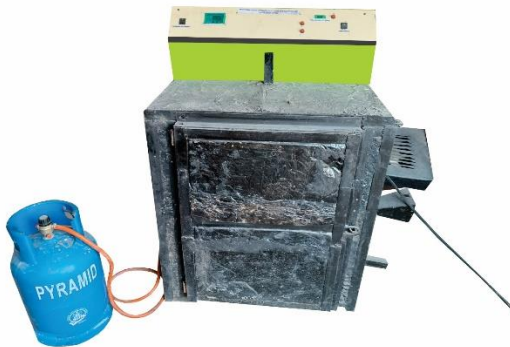
Developed Automated Dual Powered Kiln for Smoked-dried Fish

and regulated digitally with the developed kiln control system with the temperature range between 0 °C and 150 °C, this solved the problems associated with lack of control over temperature and drying rate in the mechanical kilns and traditional kin. The temperature variation inside the smoking chamber was displayed on the control panel as it increases or decreases. The temperature display help in the monitoring of the changes in smoking chamber temperature hence alleviate the drudgeries encountered in fish smoking. All the material and component part used for the developed automated dual powered kiln are locally available hence it can be mass produced and the problem of availability of spare parts will be completely eliminated. The total cost of the developed automatic dual kiln is Five Hundred Thousand Naira (₦500, 000). The detailed bill of quantity is as presented in Appendix I. The total cost of developed automatic dual kiln was relatively cheaper than the imported kilns which cost between Two million and Three million (₦ 2,000,000 and ₦ 3, 000, 000) depending on the volumetric capacity of the kilns.