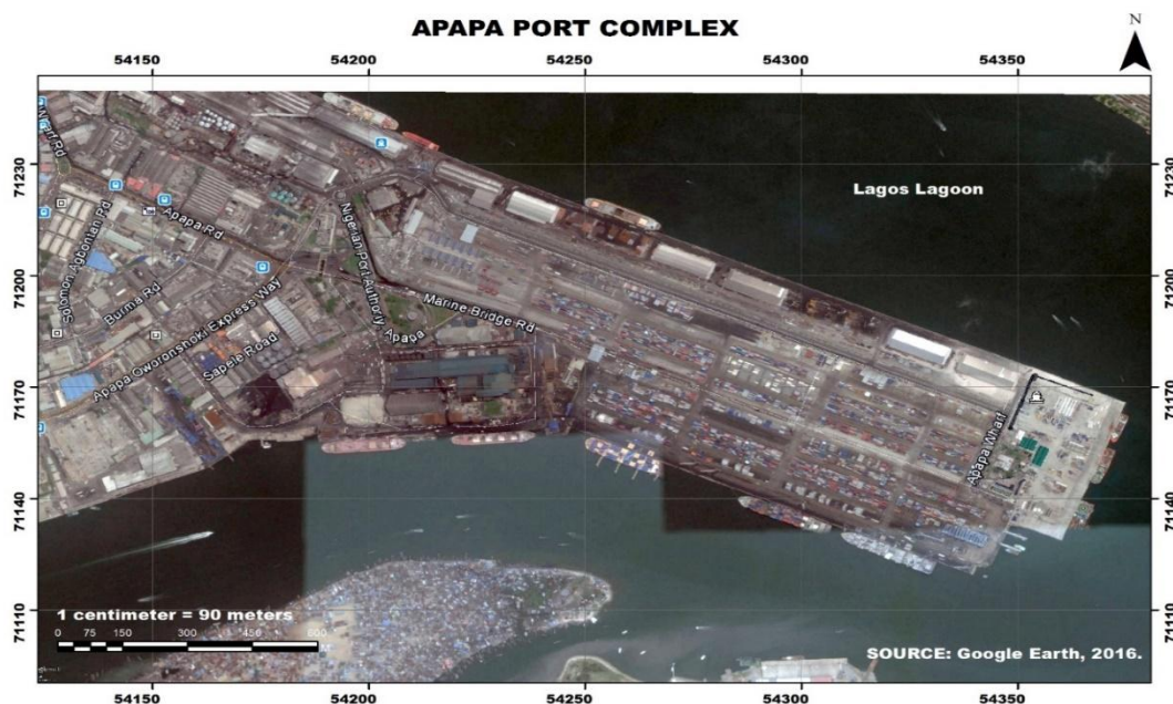
Figure 1. Apapa Port Complex

The study was carried out in the Lagos Port Complex which is located at the Apapa Area of Lagos and consisted of Apapa Port and a container terminal now called APM Terminal. It occupies a land area of about 120 hectares. Apapa port has conventional berths that service all cargo types. These include 24 berths for handling dry cargo and two berths for loading and discharging petroleum products. Six of the 24 berths are designated as container berths. The total quay length of the port is 1km and the average draught of the berths is 11.5m. It has 13 transit sheds with a total storage space of 78,869 square metres and 8 warehouses with a total space of 58,042 square metres. It also has support facilities for cargo on transit to ECOWAS countries. Apapa Port Complex was released on concession to four terminal operators namely, ABTL, ENL, GDNL and APMT. The Plate of Apapa Port Complex is presented in Figure 1.