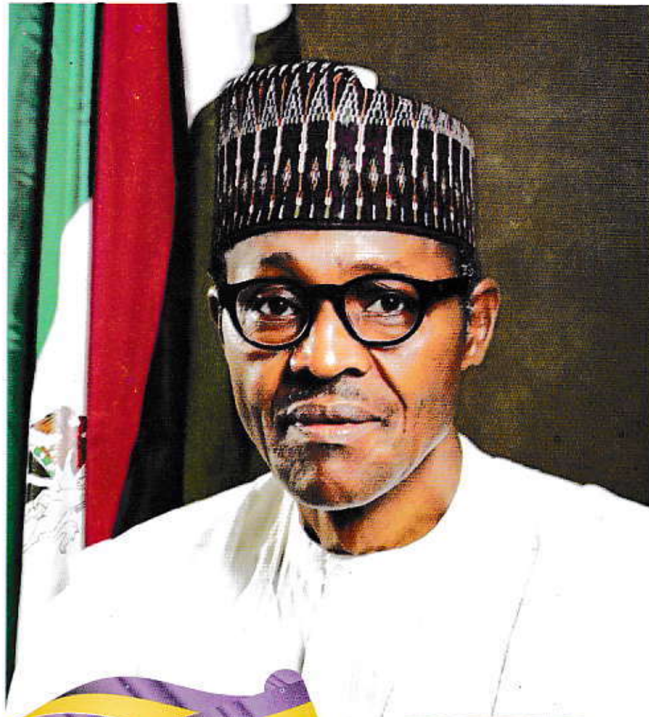
THE VISITOR His Excellency, Muhammadu Buhari, GCFR President, Commander-in-Chief of the Armed Forces of the Federal Republic of Nigeria