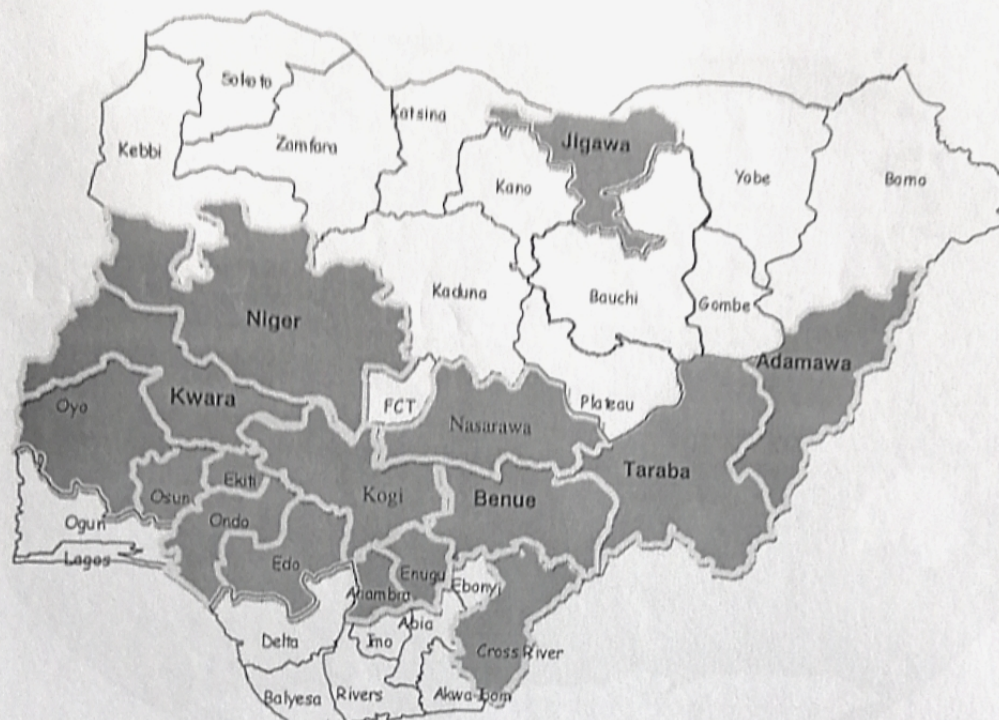
Figure 1. Potential Areas for sugar cane cultivation in Nigeria.

In Nigeria, though the cultivation of commercial sugar cane suffered a serious setback due to the poor performance of the government-owned sugar companies which have been privatized since 2002, there is the huge potential for growing sugar cane on a large scale in the country, particularly along the entire length and breadth of the rivers Niger and Benue (Figure 1) Thus, over 800,000ha of land could support high yield sugar cane production in Nigeria. Creation of or building partnership with local business to halt negative impacts on good markets and building local supports for the long term development of the sugar cane industry are being pursued for increased sugar cane productivity.