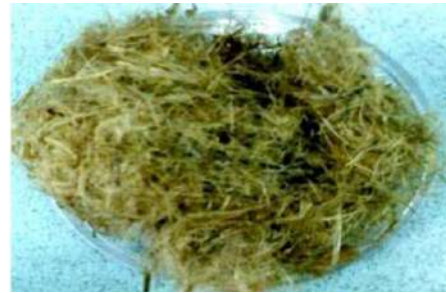
Figure 3: Coconut Fibers [109]

The percentage weights the coconut shell powder and epoxy resin binder were varied while other ingredients such as friction modifier, abrasives, catalyst and accelerator have their percentage weight kept constant as shown in Table 3.