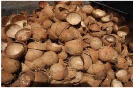
Figure 2: Coconut Shells (Abutu et al. , [108])

Bashar et al. , [32] in their contributions used coconut shells shown in Figure 2 to replace asbestos to produce based brake pads. The formulation consists of other ingredients coconut shells powder as filler, epoxy resin binder, reinforcement of Iron chip, methyl ethyl ketone peroxide as catalyst, cobalt nephthanate as accelerator iron and silica as abrasives and brass as friction modifier.