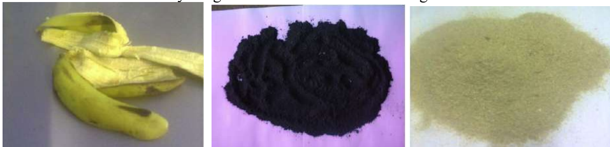
Figure 8a: Banana Peel Figure 8b: carbonized (BCp) Figure 8c: un-carbonized (BUNCp) (Source: Idris et al. , [5]).

Another authors Idris, et al. [5] in their research work produced brake pads using banana peels both carbonized and uncarbonized as shown in Figures 8a, b and c with phenolic resin. The binder was varied at 5 % by weight interval from 5 to 30 % weight.