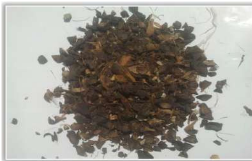
Figure 1a: Palm kernel Shell [102]

Quite a number of researchers have attempted to use either Palm Kernel Shells (PKS) as shown in Figure 1a, fibers (Figure 1b) or slag to replace asbestos as filler or base material/reinforcement materials in the formulation. In the work of Deepika et al. , [4] on the fabrication and performance evaluation of a composite material for wear resistance application, PKS was used as filler material with sulphur with other brake pad materials such as, calcium carbonate, quartz, iron ore, brass chips, ceramics, cashew nut shell liquid and carbon black. The particle size of the formulation of the pulverized filler was 125 \mu m. The performance of PKS were found to compare closely with asbestos brake linings under different inertial and speed conditions. A developed brake pad materials by Fono–Tamo and Koya [100] for automobile following standard procedures from PKS showed comaprable quality results in properties compared to the comericially produced brake pads. Their results show 40.95Mpa shear strength of and hardness of 32.34Mpa repectively with appreciable coefficient of friction of 0.43. These results were in tandem with the reported findings from the work of Fono–Tamo and Koya [101] which gave frictional coefficients of between 0.37 to 0.52 though (Roubicek et al. , [7] suggested friction coefficient range of between 0.30 to 0.70.