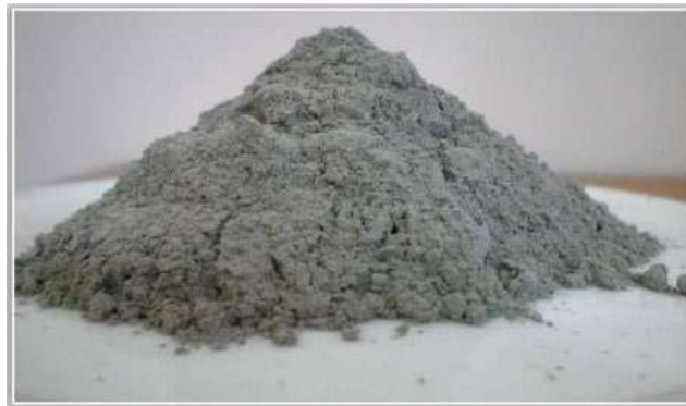
Figure 7: Fly ash.

producing automobile brake pads. In the research work, kaolin clay was explored, exploited and employed specifically for ceramic disk brake pads. It was reported that 45 micron kaolin was eventually adopted as the fillers in the waste glass matrix composite for the automobile brake pad experimentally developed. The result showed that kaolin grain sizes higher than 45 microns depressed the quality of kaolin required for the ceramic brake pad bidding and filling. Fly ash as shown in Figure 7 is a finely divided residue that is obtained when Coal (pulverized) is combusted and transported by exhaust gases by a particle filtration equipment such as electrostatic precipitators before the flue gases reach the chimneys of coal fired power plants. Though the generated waste poses a great environmental concern Anushree & Alka[115], Natarajan et al. ,[116] was still able to used the fly ash as one for brake pad production investigating the effect of the various composition on the mechanical and tribological properties of different brake pad materials.