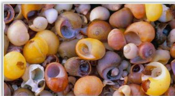
Figure 6: Periwinkle Shells [108]

Periwinkle shells as shown in Figure 6 was used to replace asbestos in brake pad production by Yawas, et al. , [111]. In this work, non-asbestos brake pad of periwinkle shell materials was developed and its properties characterized.