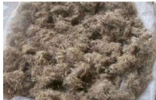
Figure 1b: Palm kernel fiber [19]

The feasibility of using PKS agro–waste material by Ibhadode and Dagwa, [31] to replace asbestos in brake pad production was also quite favourable. The optimal manufacturing variables and composition formulation was acheived via Taguchi optimization techniques. The moulding temperature, pressure, moulding temperature, curing time and heat treatment time adapted were 150–170 ^{\circ} C, 16.74–27.90 Mpa, 6–10 minutes and 1–3 hour respectively. The formulation of the various compostions used in percentage weight of reinforcement, abrasives, binder and friction modifier are respectively 56, 14, 24 and 6. The produced brake pads were tested and the results were in close agreement with the asbestos based brake pads. The characterization obtained are surface hardness 64 to 89HRB with the frictional coefficient falling between 0.44 to 0.35. The rate of wear was between 0.017 to 0.170 aligning with a report high wear rate at vehicular speeds beyond 80km/hour. The properties tested were satisfactory replacement alternatives.