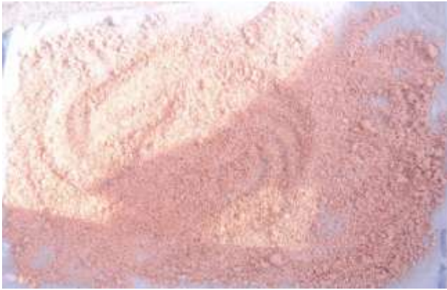
Plate IV: Residue from red guinea corn

fraction of the slurry was decanted and the starch and residue were sun dried to 10% moisture contents of as shown in plate IV.