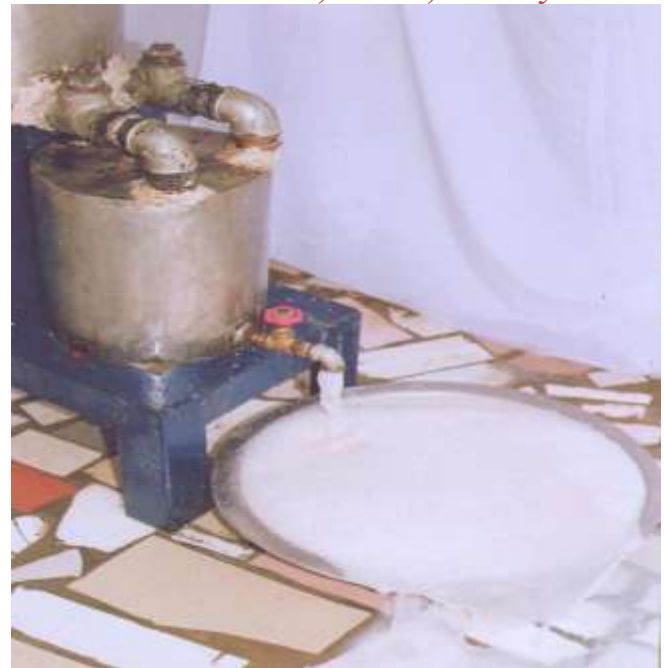
Plate II. Soybean milk during processing