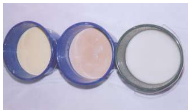
Plate III: Milled starch after processing

Three litres of water was added intermittently during the blending operation due to the high viscosity, flocculent protein content and stickiness characteristics of the grains. Each of the slurry was sieved with 1:7 liters of water in order to thoroughly wash the milled starch from the milk as shown in plate III. [1].