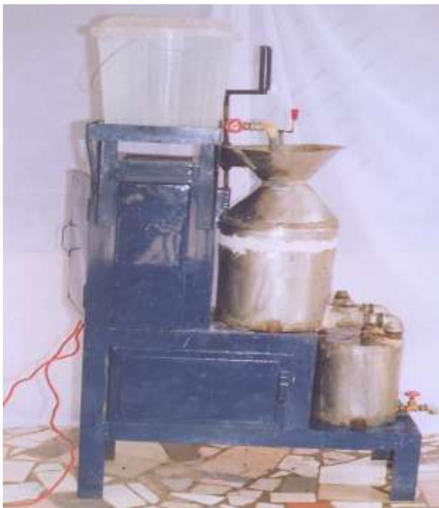
Plate I. Fabricated Grains drink processing machine

The major components of the machine include blending units, water holding tank, rotary perforated drum assembly and power unit. The blending operation is achieved by disengaging the perforated drum from rotation while the central shaft is in motion while the separation operation is achieved by allowing the perforated drum to rotate together with the central shaft as shown in plates I&II.