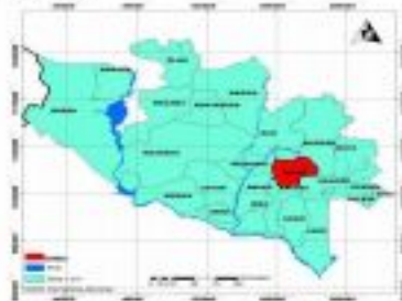
Figure 1 Map of Niger State showing Minna City

Minna, is a rapidly growing urban centre in North-Central Nigeria which is located between Latitudes 9°42' N and between Longitude 8°55' N. It lies wholly with the physical and cultural zone of transition described as the "middle belt of Nigeria". Kaduna and Federal Capital Territory border the State to both North-East and South-East respectively. Minna has a total land area of 74,344 km 2 wide and it is approximately 8% of the land area of the country. Minna is a town comprising majority Gbogi, Nupe and Yoruba and Hausa speaking people. The population of Minna has grown 176,756 (NPC 2016) at 3.2% growth rate. There are twenty-four neighbourhoods in Minna. The main modes of transportation in the City include Cars/taxis, Mini-buses and motorcycle popularly known as 'okada' and tricycles known as 'keke napep'.