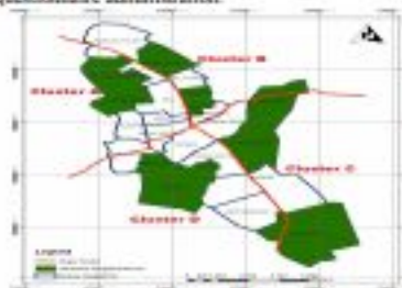
Figure 2 Selected 12 Neighbourhoods in Minna.

A cross-sectional survey approach was used to examine the influence of GSM usage on household's travel in the city. A multistage sampling technique was adopted for this study. The study area was first divided into four clusters using major traffic corridors as boundaries. In each cluster, three neighbourhoods of low, medium and high densities were selected. Figure 3 shows the neighbourhood selected for questionnaire administration.