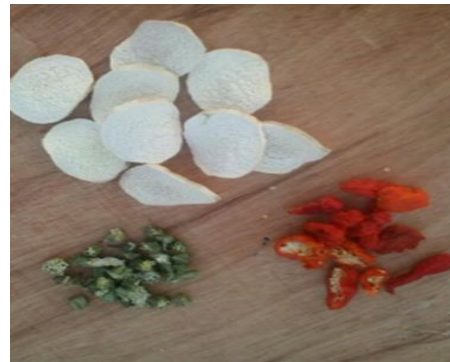
Fig.3. Solar Dried Yam, Pepper and Okra Slices