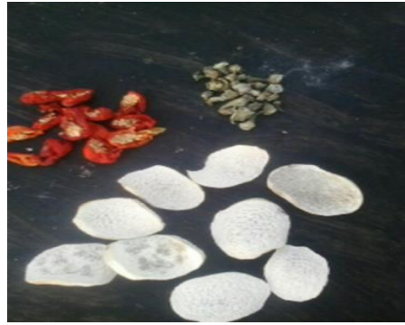
Fig.2. Sun Dried Yam, Pepper and Okra Slices