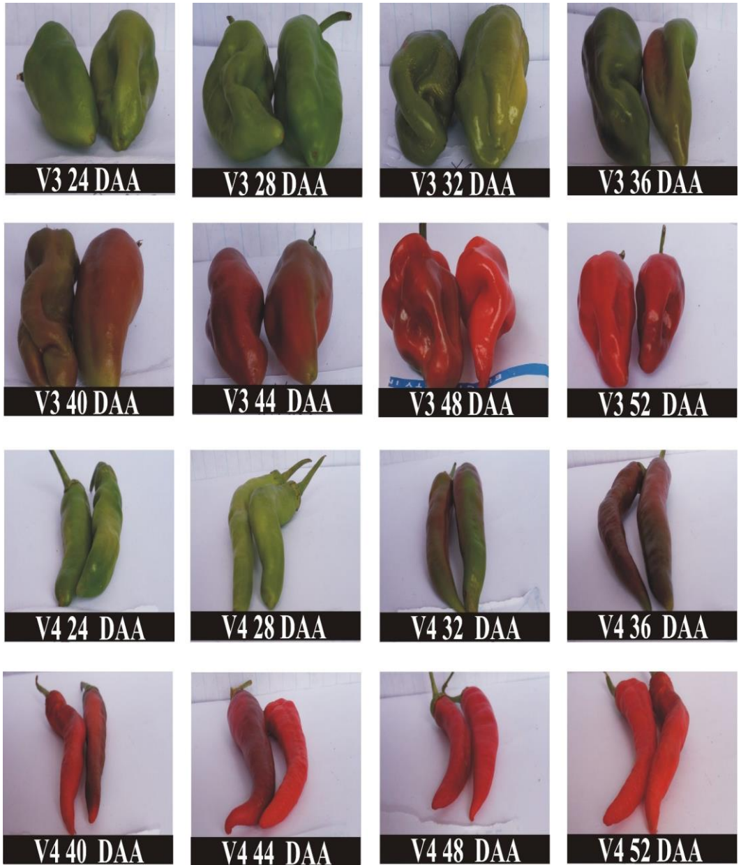
Plate 2: Changes in fruit colour with age in V3 and V4 accessions of pepper

Seeds germination of genotype V4 was significantly higher than those of other genotypes throughout the storage. Germination in seeds of V 1, 2 and 3 were statistically similar prior to storage and up till 14 days of storage after which V2 germinated significantly higher than those of V 1 and 3 (Table 1).