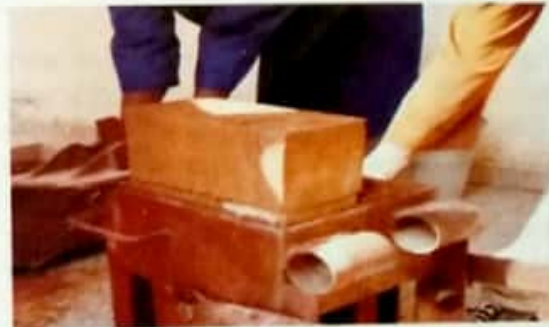
Fig. 1: Compressed Earth Brick

Thereafter, curing was continued by sprinkling water, morning and evening and covering the bricks with polythene sheet for one week to prevent rapid drying out of the bricks which could lead to shrinkage cracking. The bricks were later stacked in rows and columns with maximum of five bricks in a column until they were ready for compressive strength test.