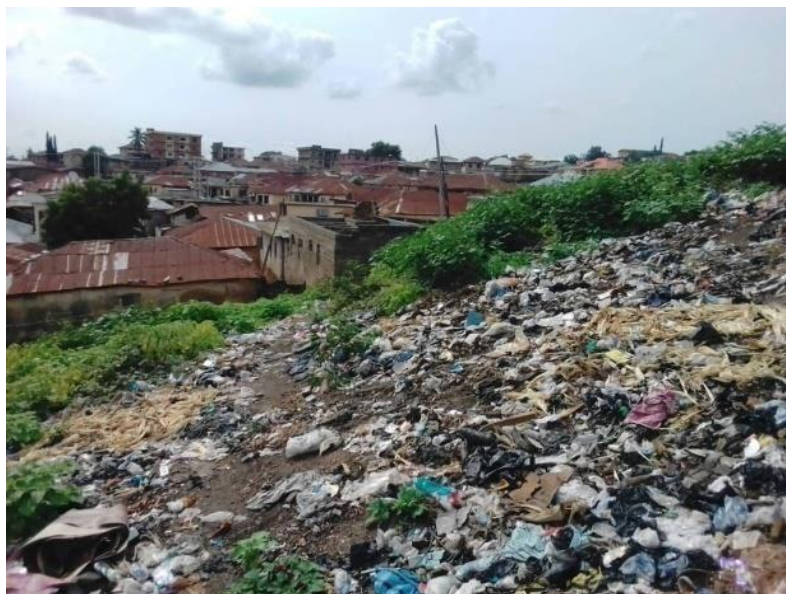
PLATE I Okene dumpsite in Kogi State.

kele dumpsites (Plate III) in Minna. Kabba (KB), Lokoja (LK). A Reference site (REF) was chosen also 100m away