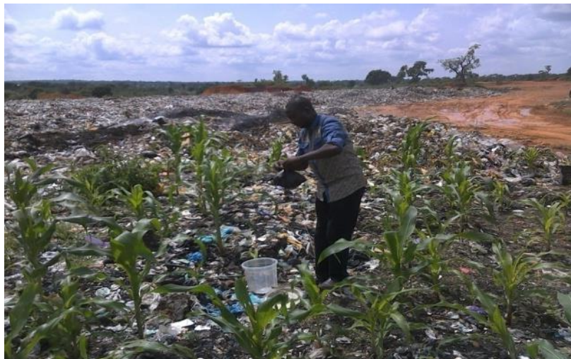
PLATE III Maikunkele dumpsite, Minna, Niger State

Soil samples were collected randomly from the dumpsites and the reference site using depth calibrated soil auger at a depth level 0-5cm, 5-15cm and 15-30cm. The samples of soil were collected into clean polythene bags and tightly sealed as recommended by Olayinka et al. (2014).