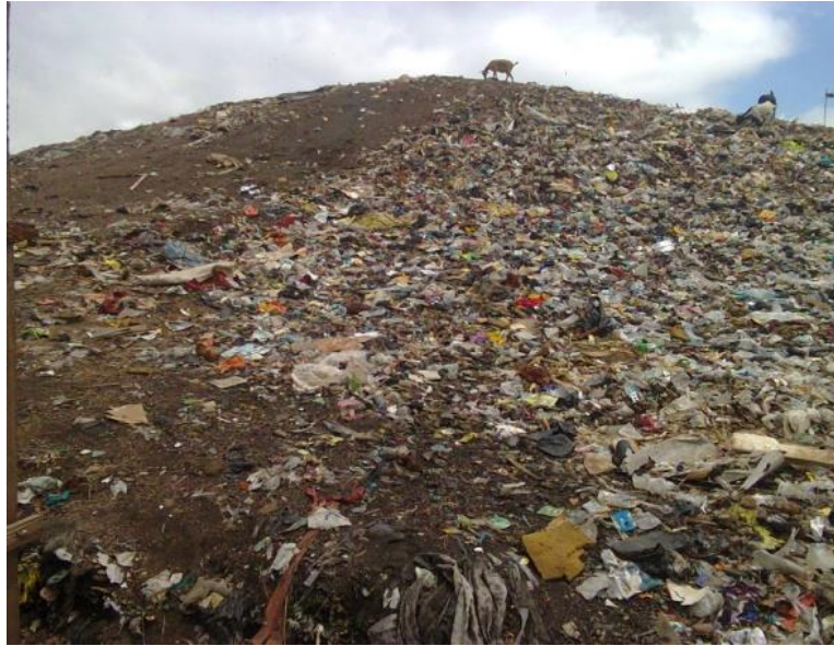
PLATE II Angwan Bai dumpsite, Nasarawa State