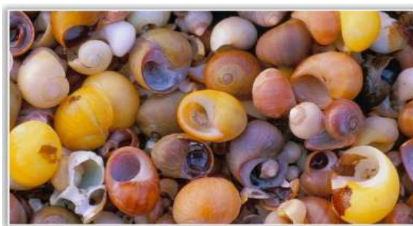
Figure 6: Periwinkle Shells [108]

Periwinkle shells as shown in Figure 6 was used to replace asbestos in brake pad production by Yawas, et al. , [111]. In this work, non-asbestos brake pad of periwinkle shell materials was developed and its properties characterized.