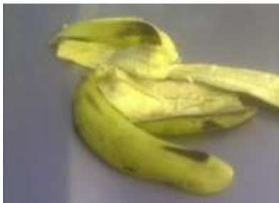
Figure 8a: Banana Peel

Another author, Idris, et al. [5] in their research work produced brake pads using banana peels, both carbonized and uncarbonized, as shown in Figures 8a, b, and c, with phenolic resin. The binder was varied at 5% by weight interval from 5 to 30% weight.