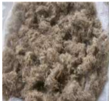
Figure 1b: Palm kernel fiber [19]

The feasibility of using PKS agro-waste material by Ibhadowe and Dagwa, [31] to replace asbestos in brake pad production was also quite favourable. The optimal manufacturing variables and composition formulation was achieved via Taguchi optimization techniques. The moulding temperature, pressure, moulding temperature, curing time and heat treatment time adapted were 150–170°C, 16.74–27.90 Mpa, 6–10 minutes and 1–3 hour respectively. The formulation of the various compositions used in percentage weight of reinforcement, abrasives, binder and friction modifier are respectively 56, 14, 24 and 6. The produced brake pads were tested and the results were in close agreement with the asbestos based brake pads. The characterization obtained are surface hardness 64 to 89 HRB with the frictional coefficient falling between 0.44 to 0.35. The rate of wear was between 0.017 to 0.170 aligning with a report high wear rate at vehicular speeds beyond 80 km/hour. The properties tested were satisfactory