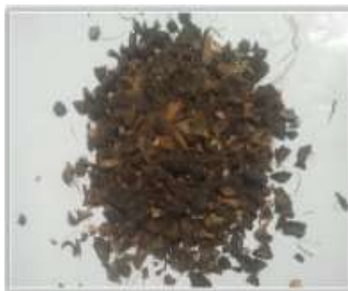
Figure 1a: Palm kernel Shell [102]