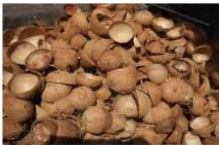
Figure 2: Coconut Shells (Abutu et al. , [108])

Bashar et al. [32] in their contributions used coconut shells shown in Figure 2 to replace asbestos to produce based brake pads. The formulation consists of other ingredients coconut shells powder as filler, epoxy resin binder, reinforcement of Iron chip, methyl ethyl ketone peroxide as catalyst, cobalt naphthanate as accelerator iron and silica as abrasives and brass as friction modifier.