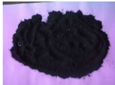
Figure 8b: carbonized (BCp)