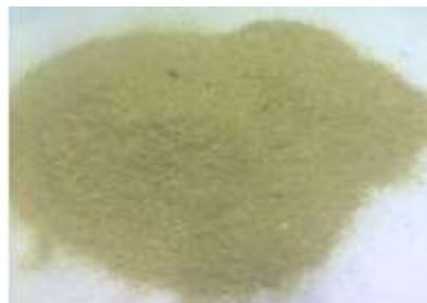
Figure 8c: un-carbonized (BUNCp).