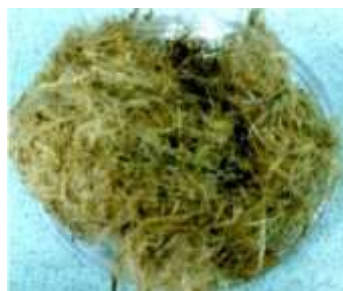
Figure 3: Coconut Fibers [109]