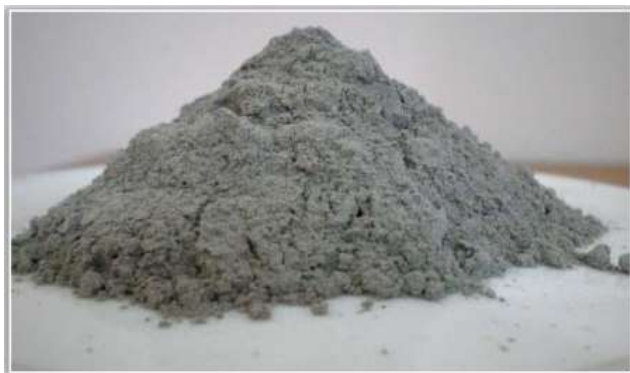
Figure 7: Fly ash.

Fly ash is composed of significant quantity of calcium sulphate, silica, alumina, and un-burnt carbon ranged 10-60% as the filler material for the brake pad production and another formulation without the fly ash. These work studied the effect of the ingredients on the tribological (coefficient of friction and wear) and the mechanical properties of different brake pad materials indicating coefficient of friction of the fly-ash in the range of 0.35 to 0.48 and better than the barites based (which do not contain fly-ash) and asbestos based brake pads. The wear resistance of the friction material was reported to have