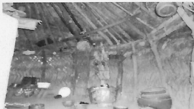
Figure 1: Interior of a Hausa traditional house (Agboola and Zango, 2014).

The Hausa people are predominant in Northern Nigeria and majorly Islamic, because of their location which is close to North Africa and the Arab world (Asojo & Asojo, 2015). The Hausas are believed to have lived in small agricultural communities, before any form of urbanization took place. Elleh (1997) stated that Hausa settlement patterns were of two main types; the indigenous settlement pattern and the Islamic pattern, which was influenced by the emergence of Islam after Jihad. The Islamic pattern settlement was a modification of the indigenous.