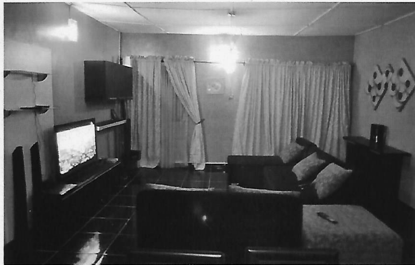
Figure 3: A living room interior in post-colonial Nigeria

The competition towards striving for modernity in Nigerian Architecture was at a peak due to the oil boom in the late 1970s (Ikebude, 2009), which influenced development. At that time, the building industry depended a lot on 'the new'; imported building materials and finishes, discarding 'the old'; traditional practices. Interior design at this time took an entirely different form, embracing simplicity, functionality, creative open floor plans, and straight lines rather than curved and windows basically to admit natural light, as shown in Figure 3. The use of materials like marble, leather, terrazzo, ceramic etc. predominantly took over the domestic interior design scene. Interaction and relationship between household furniture became necessary and widely in vogue. Furniture is usually lighter in weight with some serving multiple purposes while others can be modular. Furniture materials are kept very simple and in unison in terms of colour and arrangement with other household furniture.