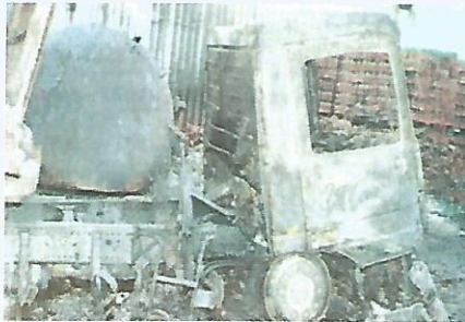
Plate 2: A typical Work Place Accident preventable through regular Factory and Labour Inspections