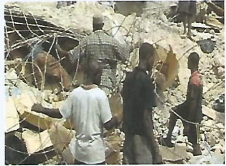
Plate 1: A collapsed building due to use of sub-standard material.

The sources of accidents on construction sites can be attributed to four (4) major factors. These are the design, construction, physical/environmental factors and mechanical factors (Ayininuola and Olalusi 2004). Ayininuola and Olalusi (2004) asserted that a large number of accidents have occurred in building sites due to failure of temporary or partially complete structures and poor specification. Ayininuola and Olalusi (2004) described failure as an unacceptable difference between expected and observed performance. A failure can be considered as occurring in a component when that component can no longer be relied upon to fulfill its principal function and therefore this can cause a health hazard. Ayininuola and Olalusi (2004) observed that many accidents in Nigeria have occurred in building sites due to lack of sufficient technical expertise by the builder. For instance, use of sub-standard material has led to building collapse as shown in Plate 1.