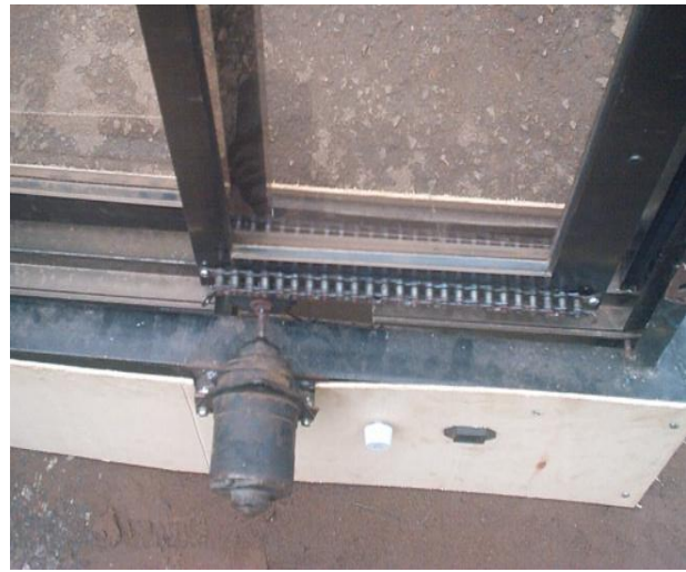
Figure 5: The Mechanical Door Showing the Lever System.