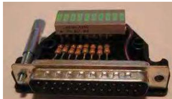
Figure 1: Parallel Port Snapshot showing the 25 Pins and Internal Circuitry.

Most of the external devices like electrical, mechanical and electromechanical devices that computer controls in recent time is being done through the parallel port of the PC and this is otherwise known as hardware interfacing . Hardware interfacing is simply the act of enabling communication between designed hardware and digital computer. This interfacing is usually done on most occasions through the port cable, one end of the cable is plugged into the parallel port on the computer system and the other end is connected to the hardware to be interfaced for the communication process to ensue. Figure 1 displays the configuration of the pins of the cable and the internal circuitry of the ends of parallel port cables.