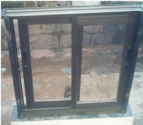
Figure 4: The Constructed Mechanical Door in its Entirety.